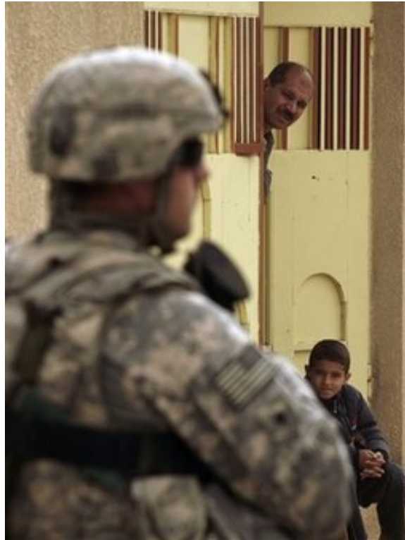
U.S. Army soldier in southwestern Mosul, 360 kilometers (225 miles) northwest of Baghdad, March 14, 2009.