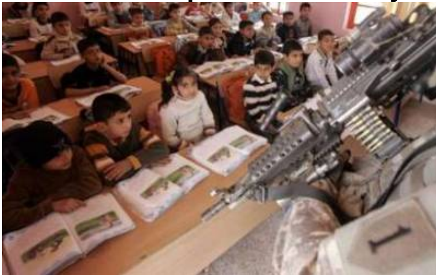
A U.S. soldier visits a classroom in Baghdad's Hurriya district March 5, 2009.

“And Today’s Show And Tell Is All About Ancient History, When Invading Foreign Armies Occupied Our Country”