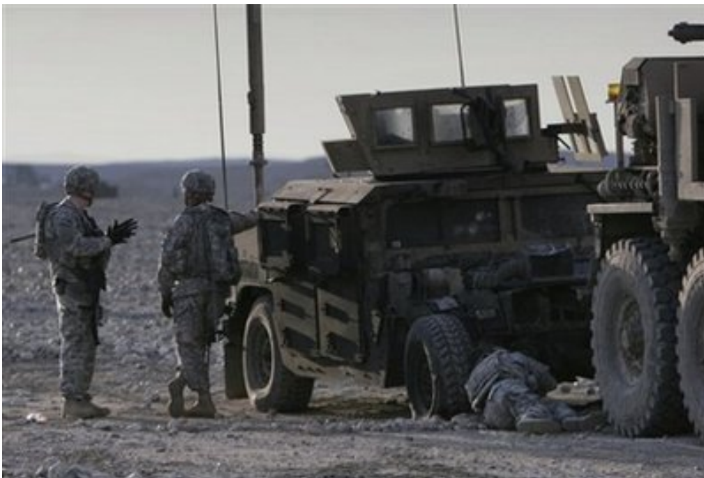
U.S. soldiers are seen close to their damaged Humvee armored vehicle after a car bomb attack in Basoud district of Ningarhar province east of Kabul, Afghanistan, Feb. 5, 2009.