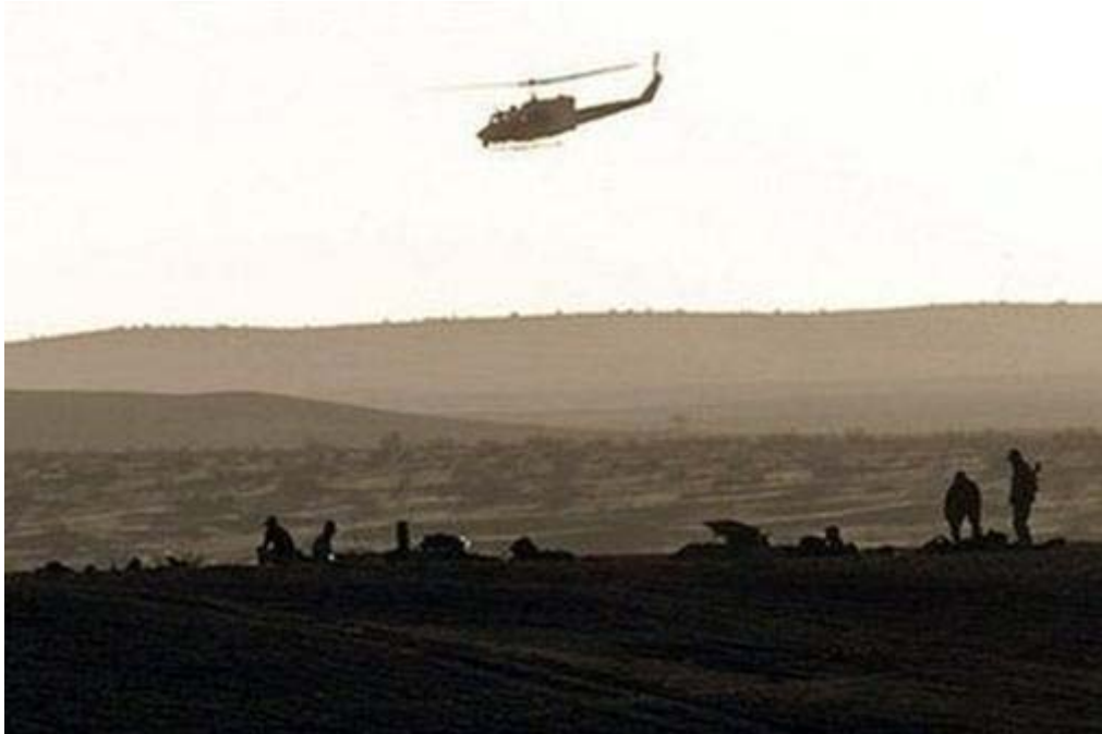
March 10 2009: A US Marine UH-1N Huey helicopter flies near a marine troop dug into a hillside in the desert in southern Afghanistan.