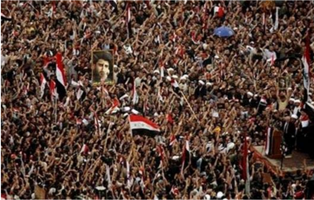
Iraqi citizens against the occupation gather in Firdous Square in central Baghdad, Iraq, April 9, 2009.