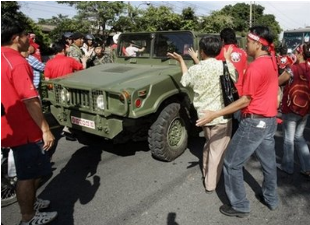
Anti-dictatorship demonstrators appeal to soldiers to join their cause near the Foreign Ministry April 12, 2009, in Bangkok, Thailand.