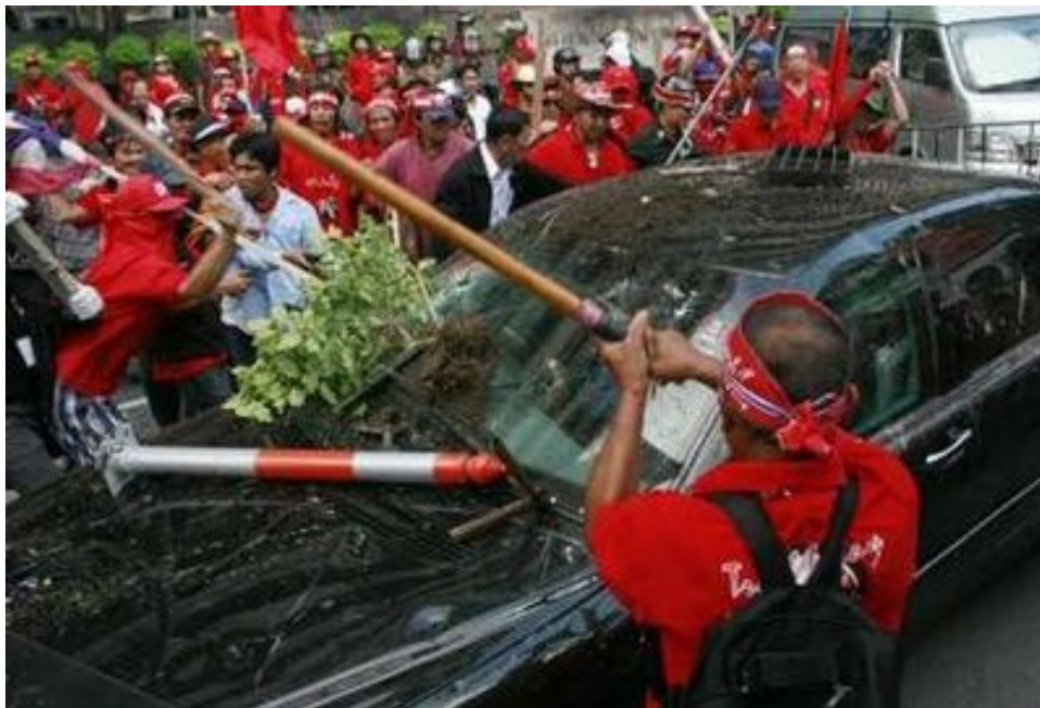
Protesters surround and beat the car carrying Thai Prime Minister Abhisit Vejjajiva at the interior ministry in Bangkok April 12, 2009.