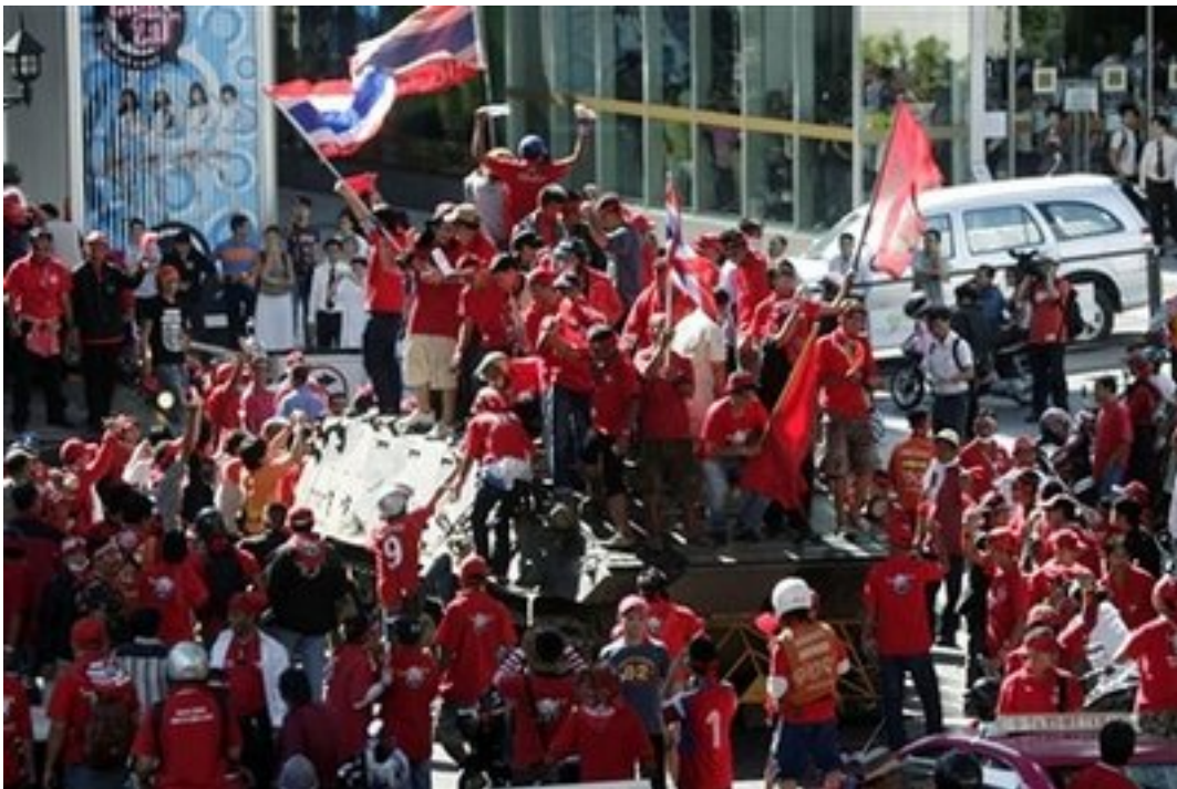
Revolutionary forces celebrate on top of an armored personnel carrier sent against them in Bangkok on April 12, 2008. Soldiers inside made no effort to stop them.