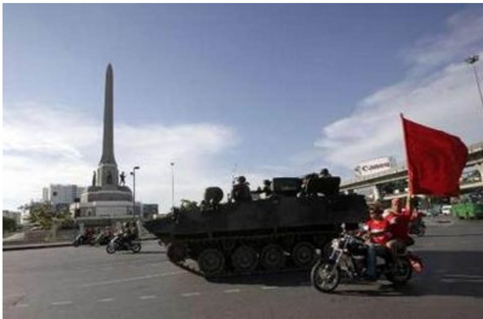
Anti-government motorcycle patrol escorts an armoured personnel carrier returning to a military base in Bangkok April 12, 2009. Soldiers agreed to go back to their base after being ordered onto the streets against the people by the Thai government dictatorship.