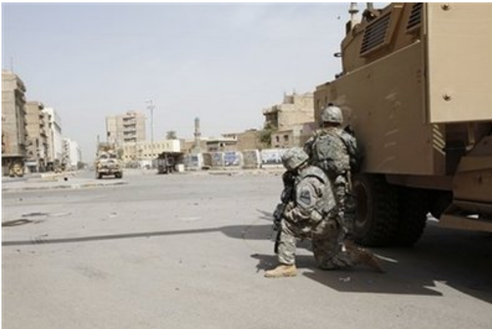
U.S. troops take up position on a major street after a gunfight between Iraqi militias at the neighborhood of Fadhil in Baghdad, March 29, 2009.