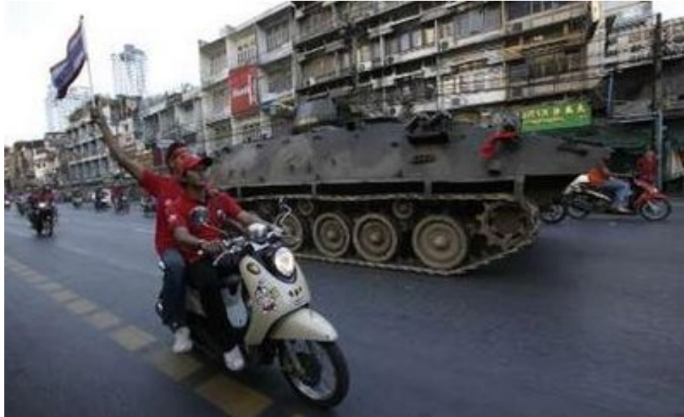
Anti-dictatorship motorcycle patrol escorts an armoured personnel carrier returning to a military base in Bangkok April 12, 2009. Soldiers agreed to go back to their base after being ordered onto the streets against the people by the Thai government dictatorship.