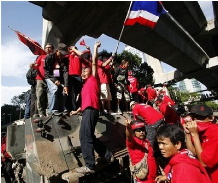
Anti-government demonstrators cheer on top a Thai Army armored personnel carrier Sunday, April 12, 2009, in Bangkok, Thailand as a tide of anti-government protest sweeps across the country.