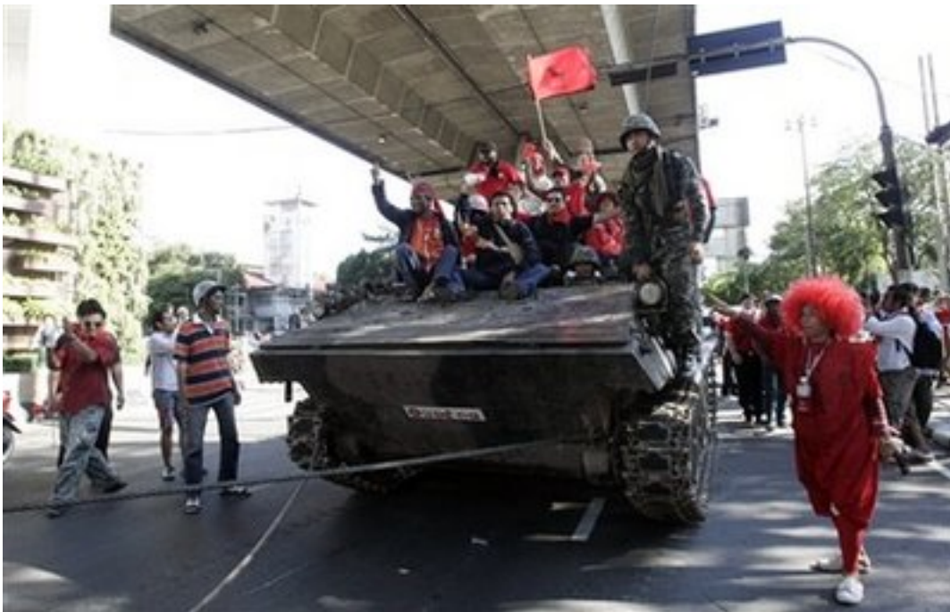
Soldiers and Thai demonstrators fighting corrupt Thai government put in power by Generals together on an Army armored personnel carrier near the Foreign Ministry Sunday, April 12, 2009, in Bangkok, Thailand

[There is no assurance whatever that the Generals who run Thailand and its government of corrupt scum won't find some troops to use to hold power. That said, there is no assurance that they will, either. If the Generals order their soldiers to open fire on their own people, and the soldiers refuse, the Generals are dead men. T]