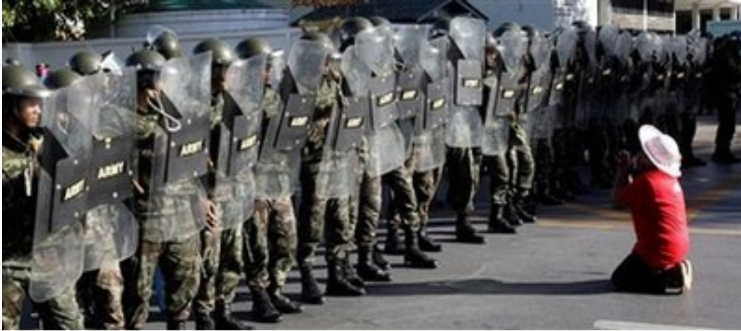
An anti-government protester kneels down to plea for Thai soldiers not to use violence against protesters on the street near government house in Bangkok, Thailand April 12, 2009.