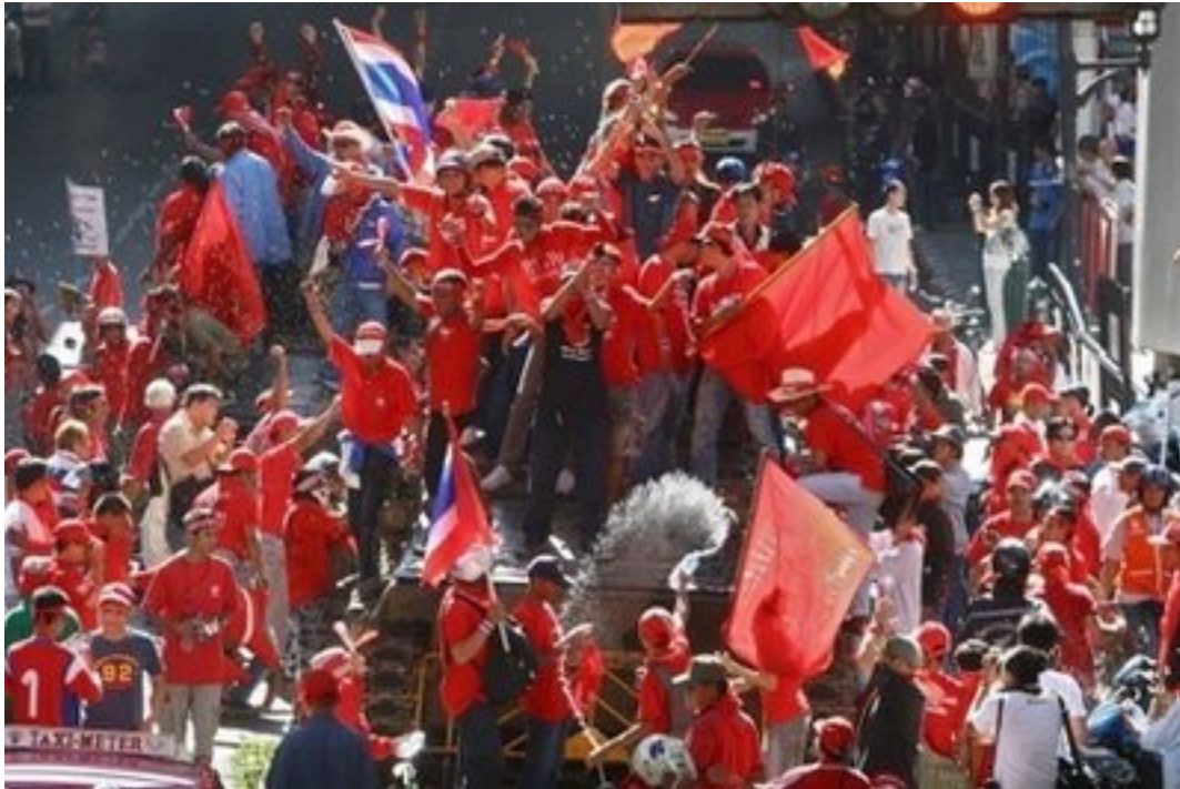
Revolutionary forces celebrate on top of a tank [An APC, not a tank. T] sent against them in Bangkok on April 12, 2008. Soldiers inside made no effort to stop them.