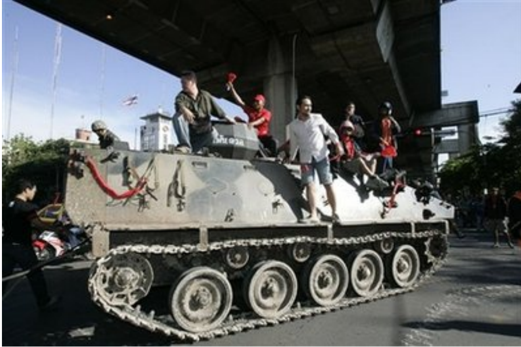
Happy anti-government demonstrators with soldier, left, on top of a Thai Army armored personnel carrier near the Foreign Ministry April 12, 2009, in Bangkok, Thailand.