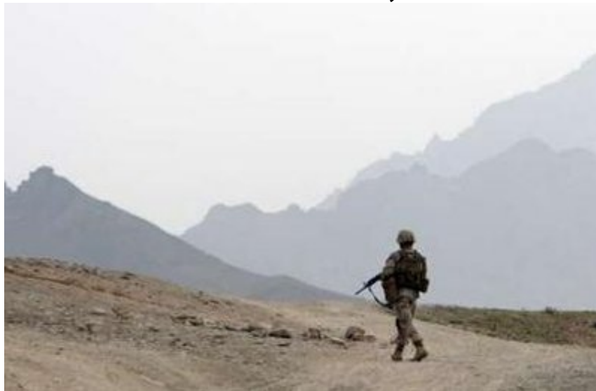
A U.S. Marine patrols in Golestan district of Farah province, May 1, 2009.