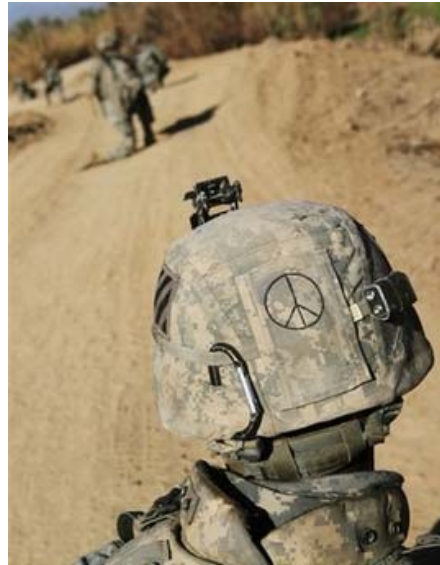
2008: U.S. Army soldier wears a peace sign on his helmet as he patrols in Bejjia village in Arab Jabour, south of Baghdad.