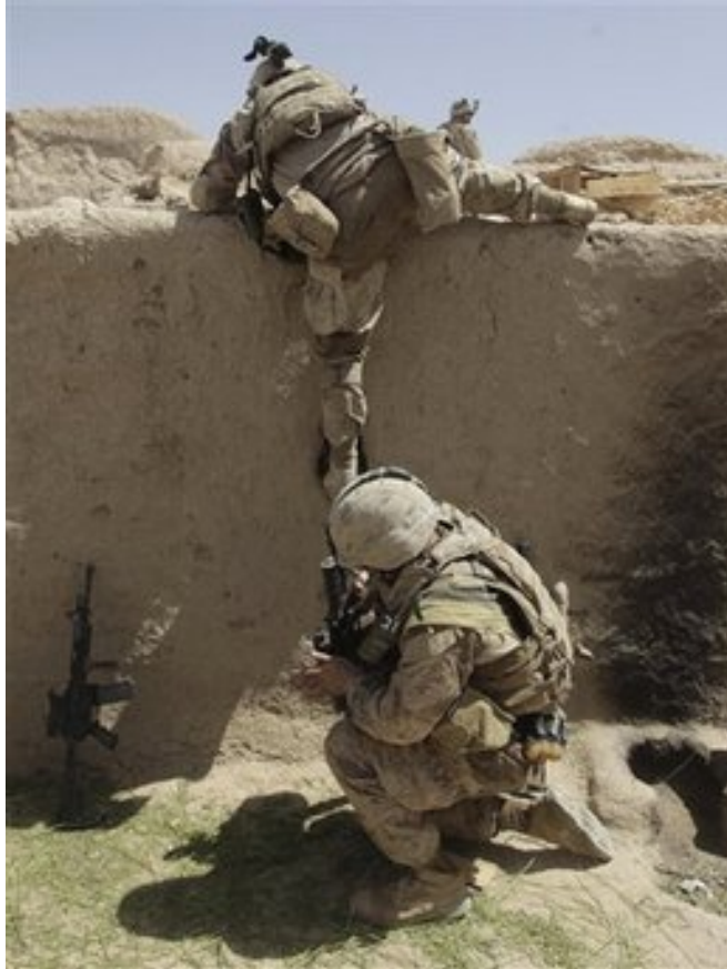
United States Marines from 2nd MEB, 2nd MEF, climb up on a rooftop to use it as an observation point while on a mission to clear the town of Dahaneh of Taliban insurgents, Aug. 13, 2009, in the Helmand Province of Afghanistan.

IF YOU DON'T LIKE THE RESISTANCE END THE OCCUPATIONS