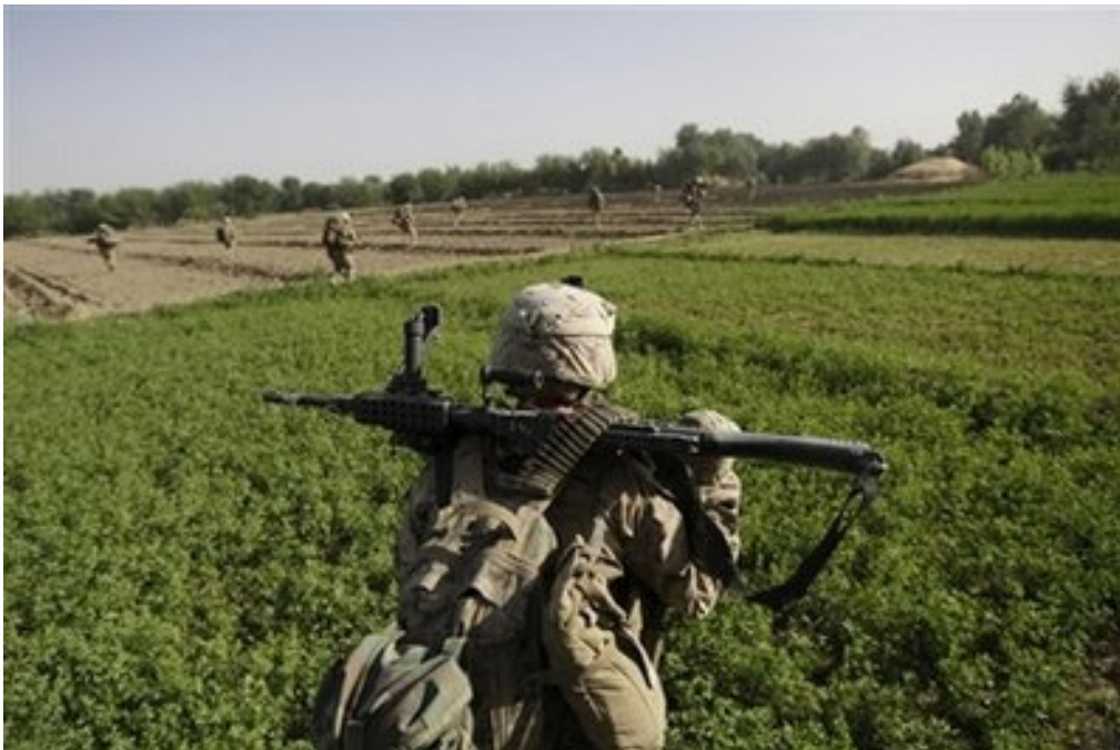
5th Marines move through farm fields after landing by helicopter in an overnight night air assault near the Taliban stronghold of Nawa in Afghanistan's Helmand province July 2, 2009.