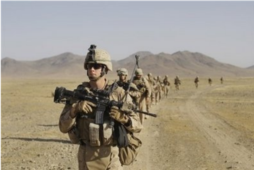
3rd Marines patrol to the village of Khwaja Jamal in Afghanistan's Helmand province June 28, 2009.