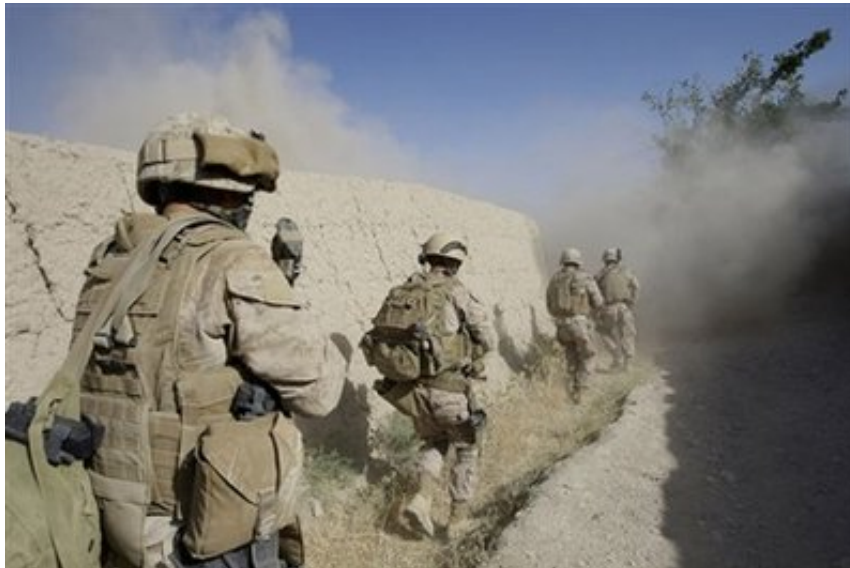
U.S. 3rd Marines as they battle Taliban fighters near Now Zad in Afghanistan’s Helmand province, June 20, 2009.

BAD IDEA: NO MISSION; POINTLESS WAR: ALL HOME NOW