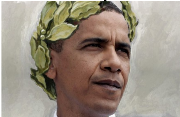
30 July 2009 New Statesman