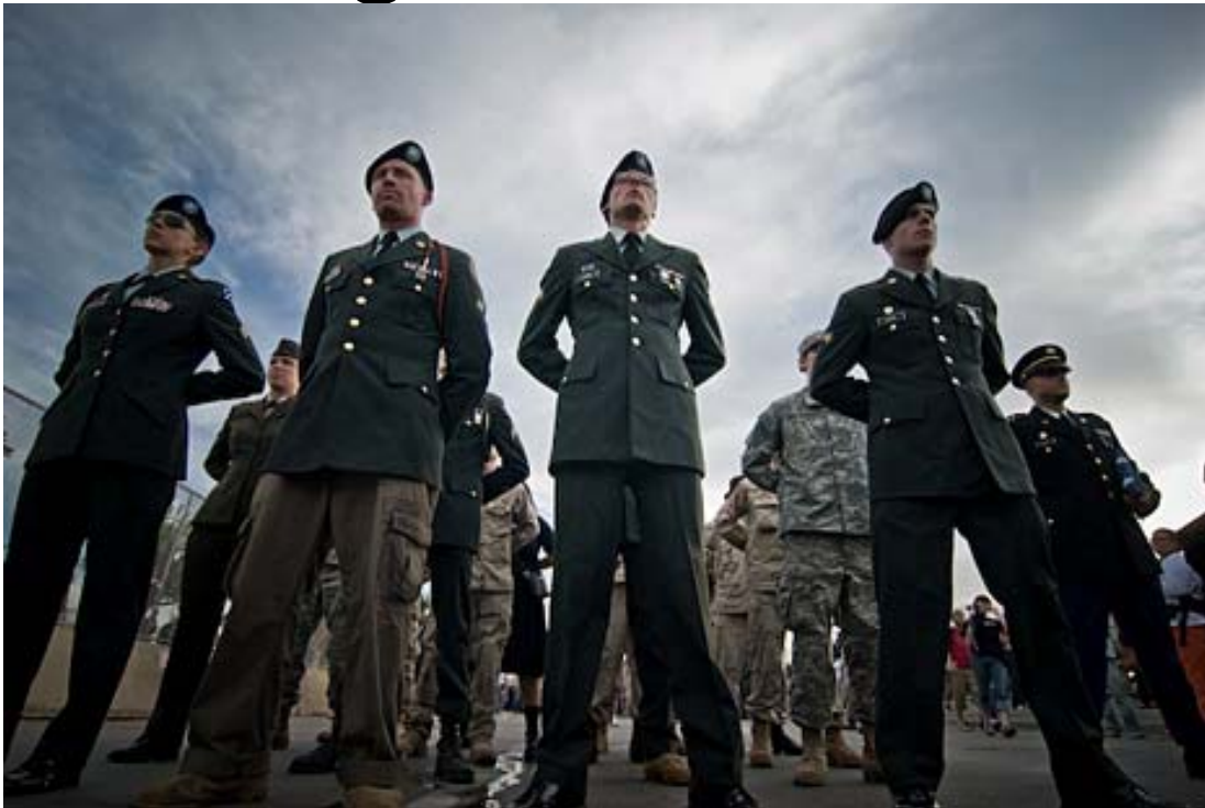
Iraq Veterans Against The War, Denver [ www.ivaw.org/ ]

“Soldiers In Uniform Began The Four-Mile March To The Pepsi Center In Downtown Denver To Protest The Iraq War”