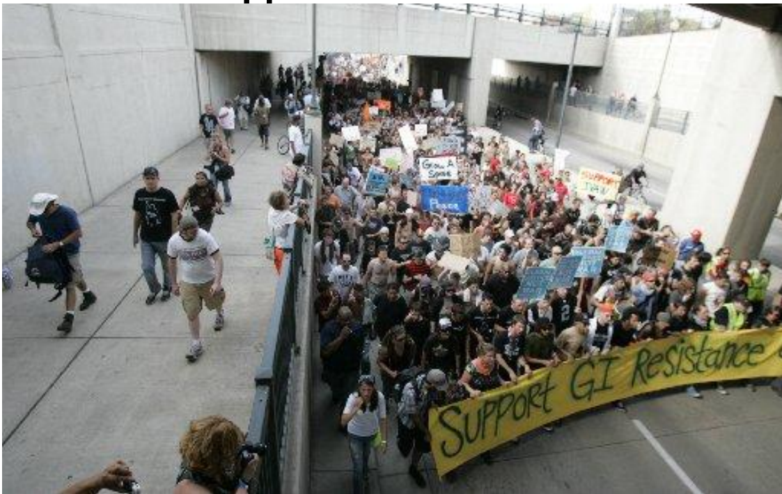
Protesters march behind Iraq Veterans Against the War Wednesday from the Denver Coliseum to the Pepsi Center after a concert by Rage Against the Machine.