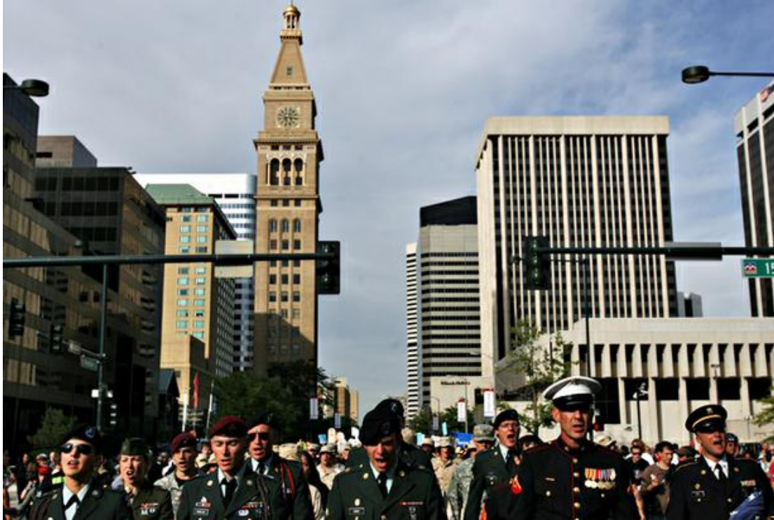
Members of Iraq Veterans Against the War (IVAW) march in downtown Denver, leading several thousands activists towards The Pepsi Center.