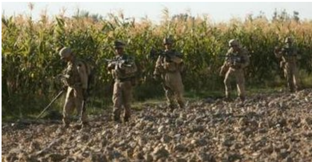
U.S. Marines use a mine detector to check for IEDs during a patrol close to Barcha village in Helmand province, October 11, 2009.

IF YOU DON'T LIKE THE RESISTANCE END THE OCCUPATIONS