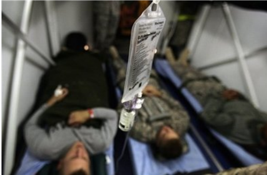
Wounded U.S. servicemen are seen on stretchers before boarding a C-135 aircraft for transport to Landstuhl Regional Medical Facility in Germany for medical treatment at Bagram Air Field in Afghanistan, Oct. 13, 2009.