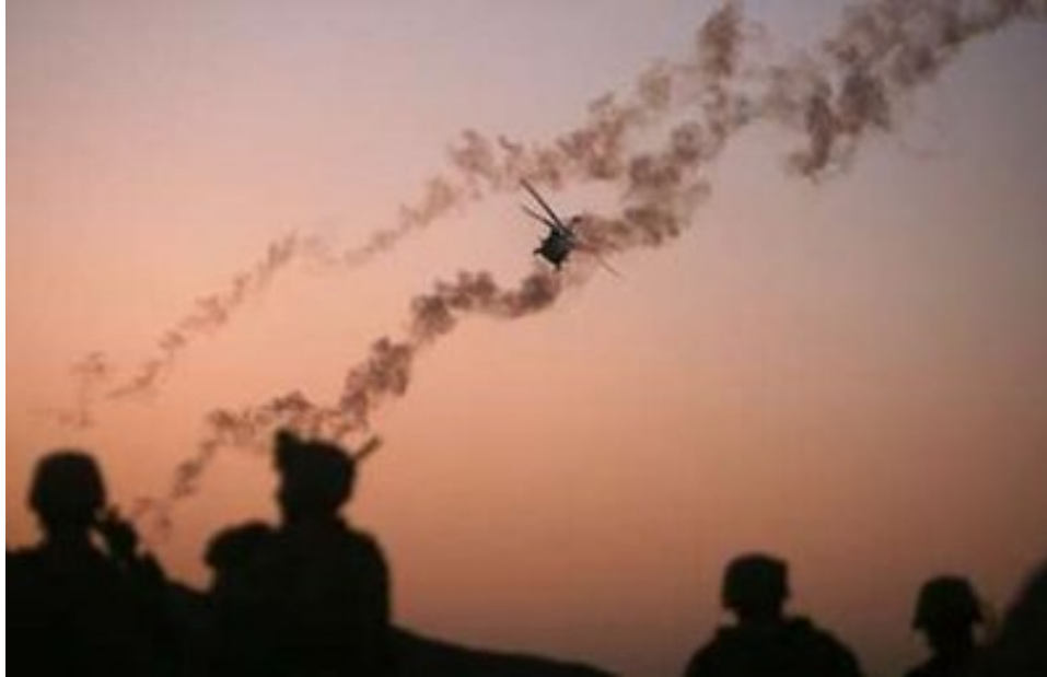
A U.S. helicopter releases flares near U.S. Marines during a Taliban ambush in southern Helmand province October 9, 2009.