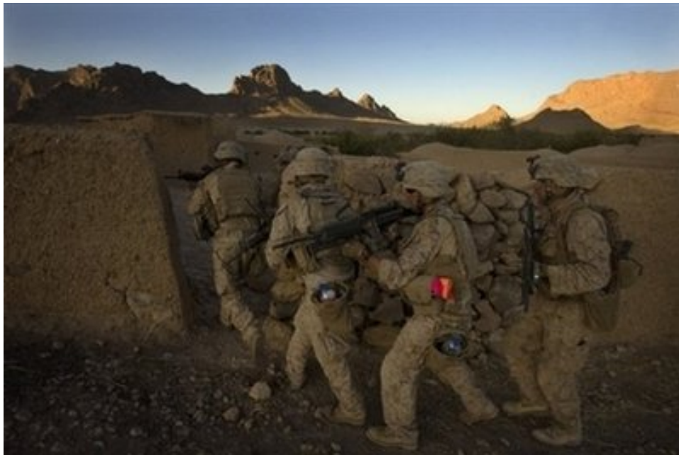
Oct 9, 2009: US Marines enter a house during Operation Germinate in Farah Province, southern Afghanistan.