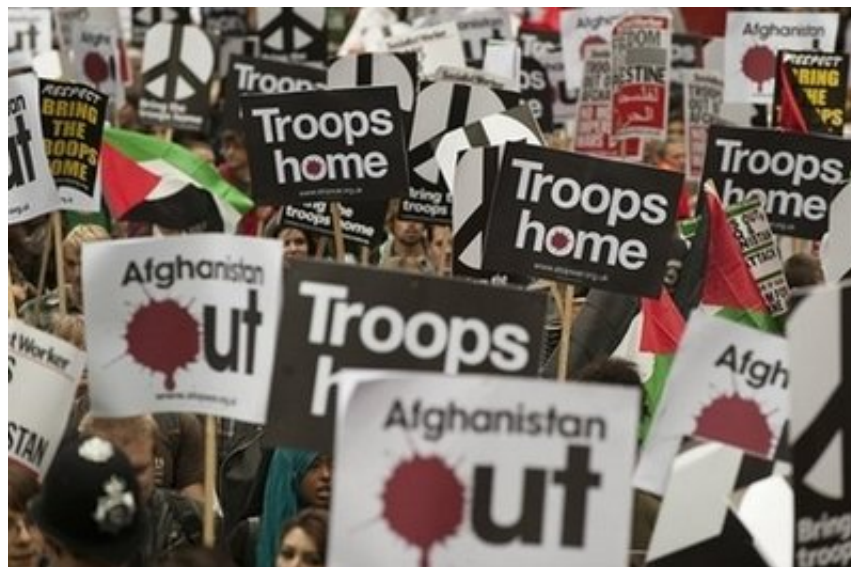
Demonstration held by Stop the War coalition calling for troops to leave Afghanistan in central London.

Only six per cent of those taking part in the poll said that British troops were winning the war, compared with 36 per cent who said they were not winning yet but eventual victory was possible, and 48 per cent who said that victory was not possible.