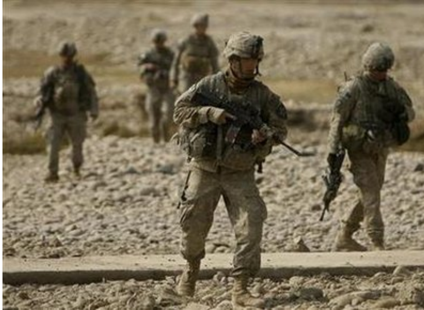
U.S. soldiers from Stryker Brigade return from an operation in Chahar Bagh village, Arghandab District, Kandahar province October 27, 2009.

BEEN ON THE JOB TOO LONG: COME ON HOME, NOW