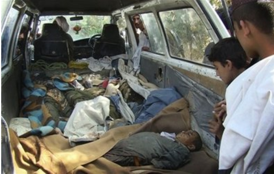
Car carrying a dead Afghan child in Lashkar Gah, Helmand Province, Afghanistan, Thursday, Nov. 5, 2009. An overnight air strike killed civilians, including children.