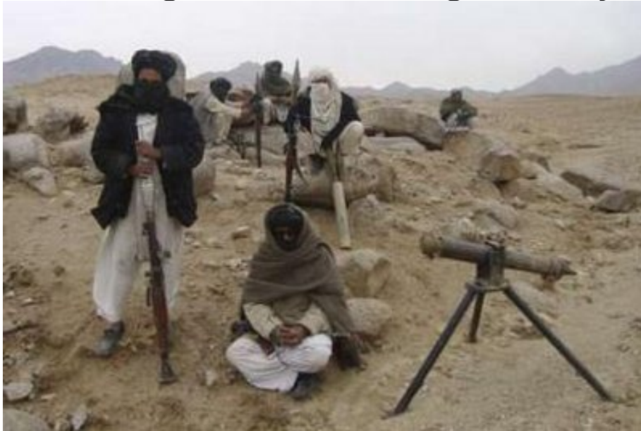
Taliban in an undisclosed location in Afghanistan October 30, 2009.

Win A VIP Trip To See The Great Landmarks Of Afghanistan And Meet The Friendly People In Their Quaint Native Costumes: They're Waiting For You And Eager To Say Hello!