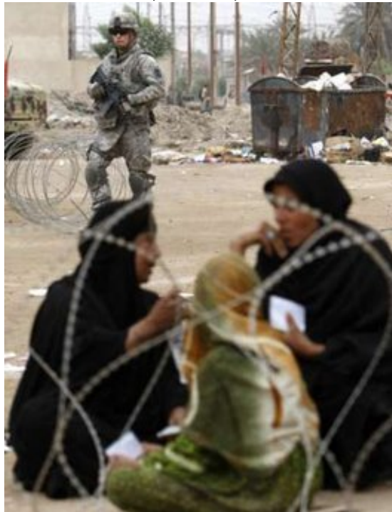
A U.S. soldier patrols in Basra, 420 km (260 miles) southeast of Baghdad November 3, 2009.

Wikipedia: “Al Basrah Is The Capital Of Basra Province, And Had An Estimated Population Of 3,800,200 As Of 2009”