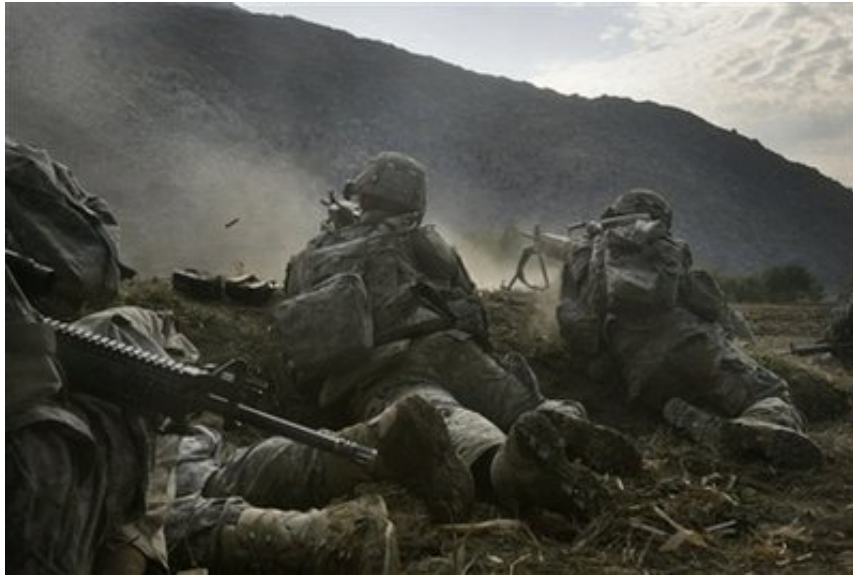
U.S. soldiers from the 2nd Battalion, 12th Infantry Regiment, 4th Brigade Combat Team, 4th Infantry Division return fire after their patrol in the Pech Valley of Afghanistan's Kunar province was ambushed by Taliban fighters Nov. 3, 2009.

Win A VIP Trip To See The Great Landmarks Of Afghanistan And Meet The Friendly People In Their Quaint Native Costumes: They're Waiting For You And Eager To Say Hello!