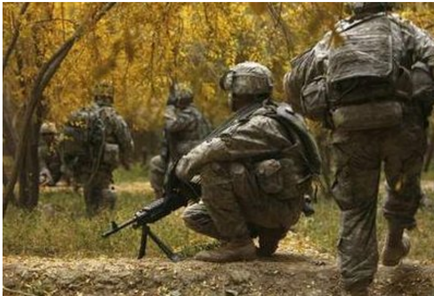
U.S. soldiers from Stryker Brigade patrol in Arghandab District, Kandahar province November 1, 2009.