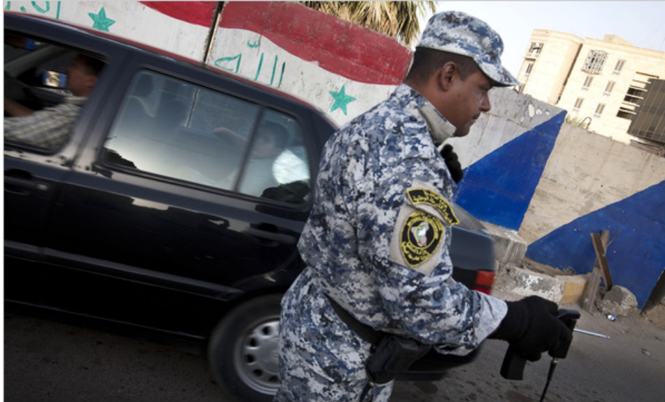
Useless device that can't detect bombs or anything else at checkpoint.

ATSC's promotional material claims that its device can find guns, ammunition, drugs, truffles, human bodies and even contraband ivory at distances up to a kilometer, underground, through walls, underwater or even from airplanes three miles high.