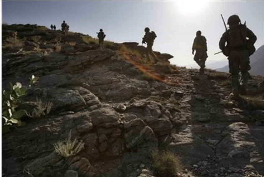
U.S. soldiers from the 2nd Battalion, 12th Infantry Regiment, 4th Brigade Combat Team, 4th Infantry Division patrol above the Pech Valley in Afghanistan's Kunar province Oct. 25, 2009.