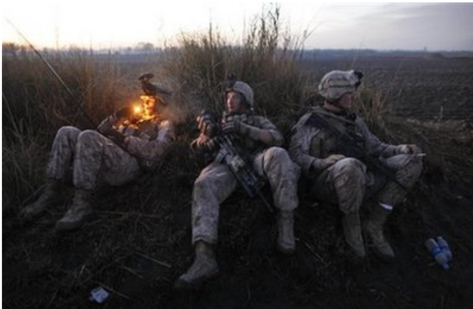
United States Marines in the Garmsir district of Helmand province, southern Afghanistan, Dec. 20, 2009.