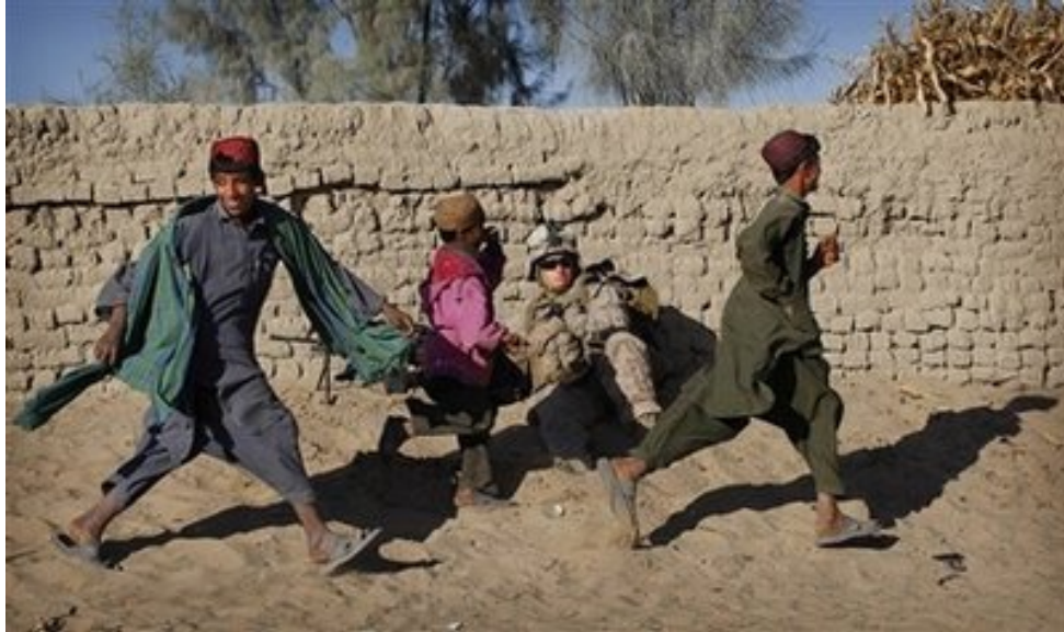
A United States Marine during an operation in the Garmsir district of Helmand province, southern Afghanistan, Dec. 17, 2009.