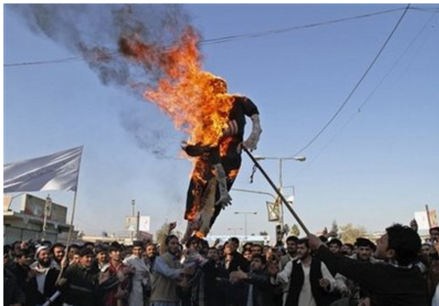
Afghans rally against U.S. military and burn an effigy of U.S. President Barack Obama in Jalalabad, south Afghanistan, Dec. 30, 2009, during a protest against the recent killings of school children by U.S. forces in Kunar province.

“You Can’t Defend The Highway By Just Sitting On It”