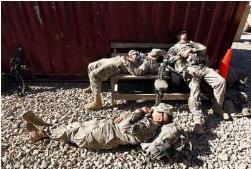
U.S. army soldiers from 1-40 CAV at FOB Clark in Khowst province, Afghanistan, December 24, 2009.

OCCUPATION ISN'T LIBERATION ALL TROOPS HOME NOW!