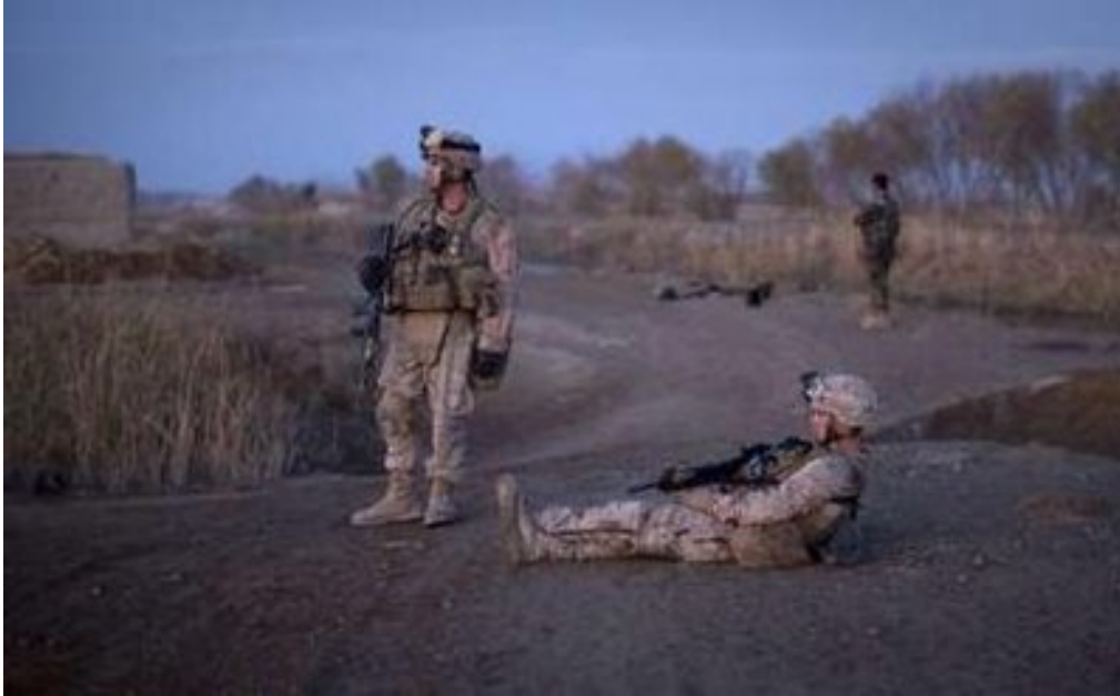
U.S. Marines in Garmsir district of Helmand Province on December 20, 2009.