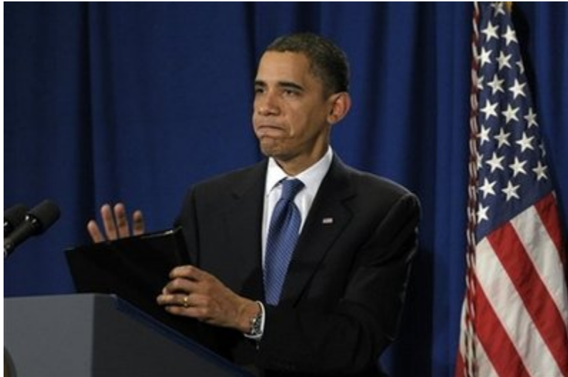
The traitor Obama Dec. 18, 2009.

“Why, I can smile, and murder whiles I smile, And cry ‘Content’ to that which grieves my heart And wet my cheeks with artificial tears,