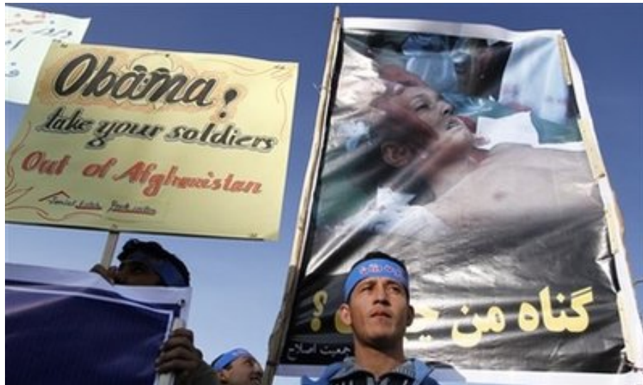
Afghans rally in Kabul, Afghanistan, Dec. 30, 2009, to protest against the recent killings of 10 civilians, including school children, by U.S. forces in Kunar province. The head of a presidential delegation investigating the deaths in eastern Afghanistan concluded Wednesday that civilians, including schoolchildren, were killed in the attack involving foreign troops, disputing NATO reports that the dead were insurgents.