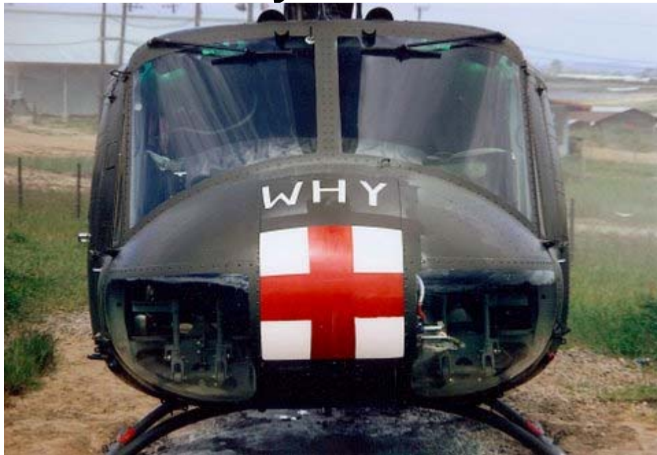
Medevac helicopter in my military unit in An Khe, Vietnam 1970