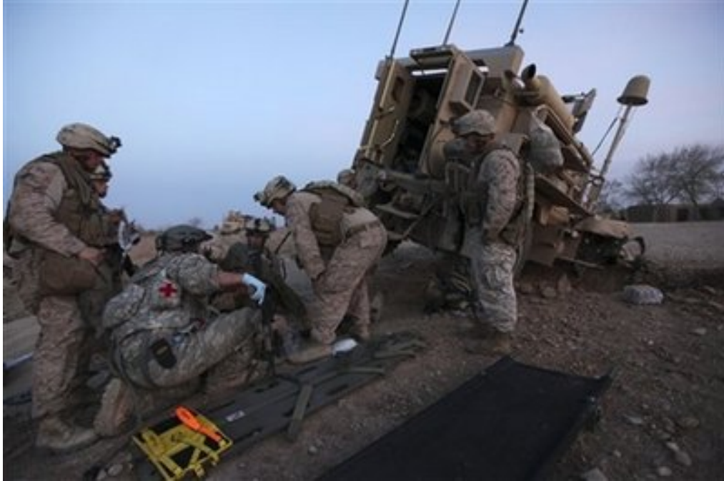
Medical personnel attend to wounded in the attack to a waiting helicopter.