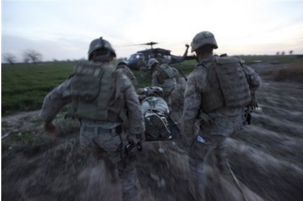
Marines carry a wounded Marine to a waiting helicopter, following an attack on their armored vehicle by a planted improvised explosive device, in Marjah, Helmand province, Afghanistan, Feb. 23, 2010.