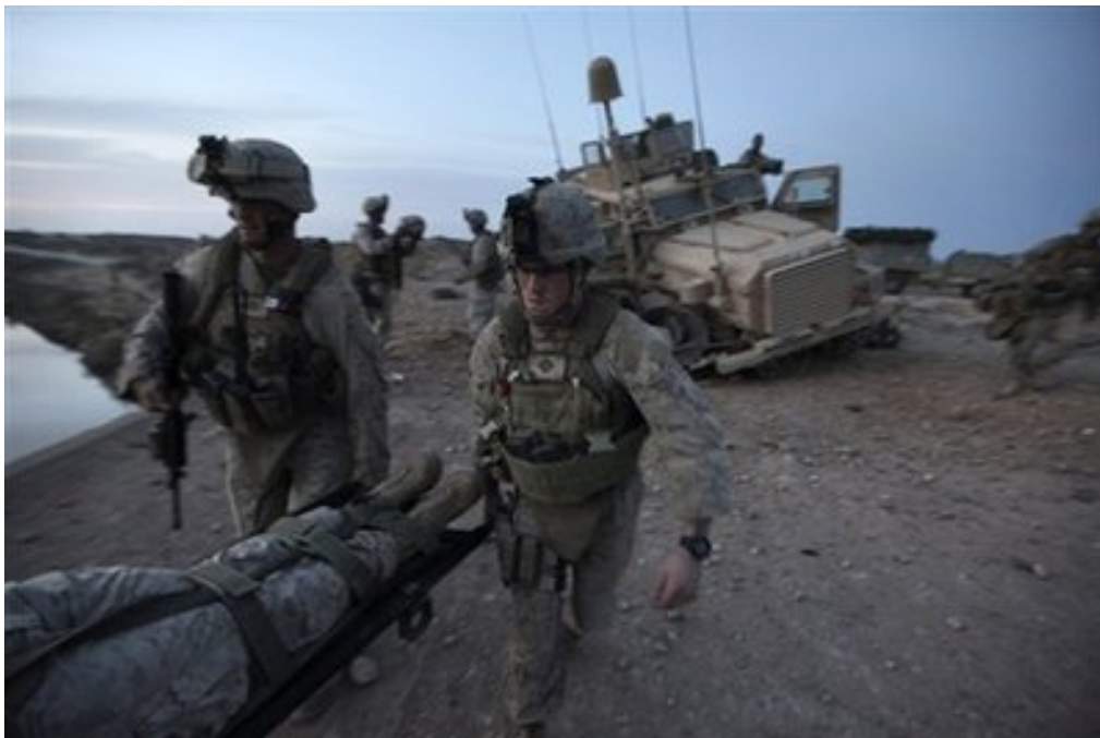
Marines carry wounded to a waiting helicopter.