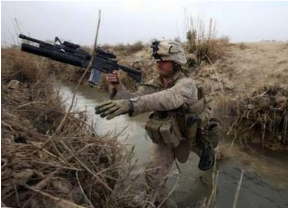
A U.S. Marine from Bravo Company of the 1st Battalion, 6th Marines during battle in Helmand province February 21, 2010.