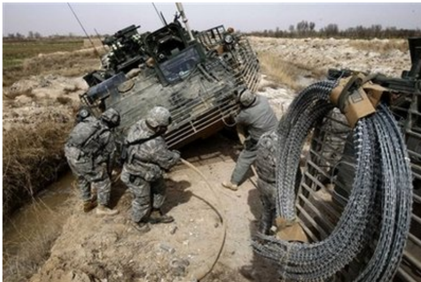
U.S. soldiers of the 4th Battalion, 23th Infantry Regiment, 5th Brigade, 2nd Infantry Division, work to retrieve a Stryker armored vehicle after it slid into a ditch on a narrow road west of Lashkar Gah in Helmand province, southern Afghanistan, Feb. 11, 2010.