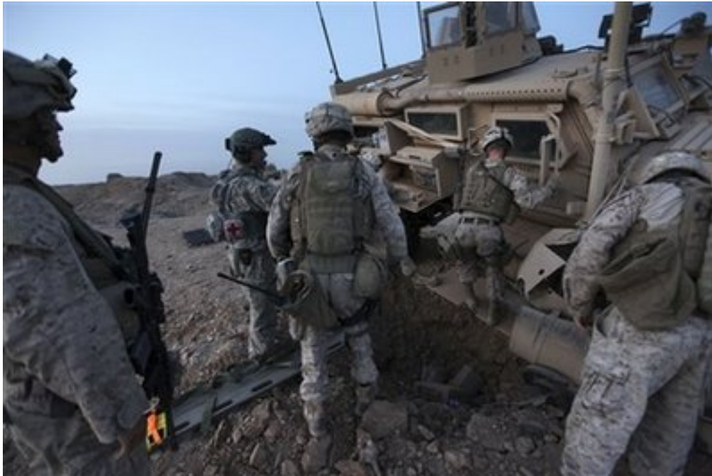
A U.S. Army flight medic, second from left, with Task Force Pegasus, gives directions as he prepares to use a backboard to extricate a wounded Marine from inside the armored vehicle.