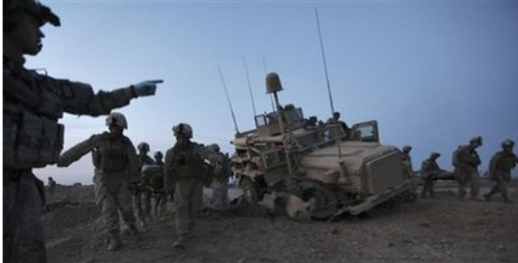
A flight medic, left, directs Marines as they carry two wounded to a waiting helicopter. Pegasus crews are providing daily the fast medical evacuation of those wounded in Marjah.