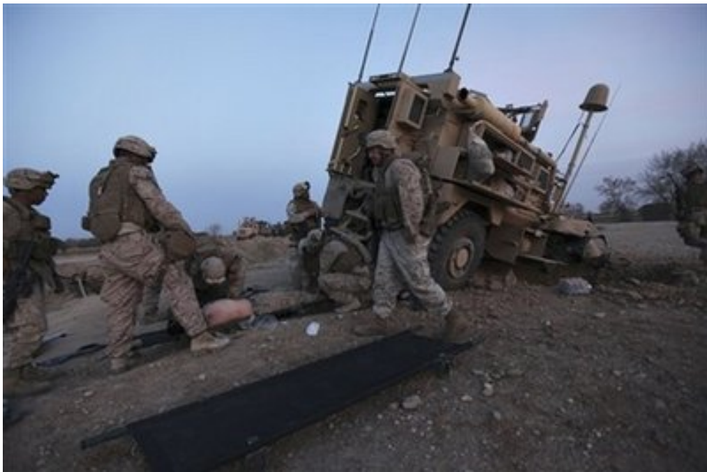
Marines preparing to move a wounded Marine to evacuation helicopter.