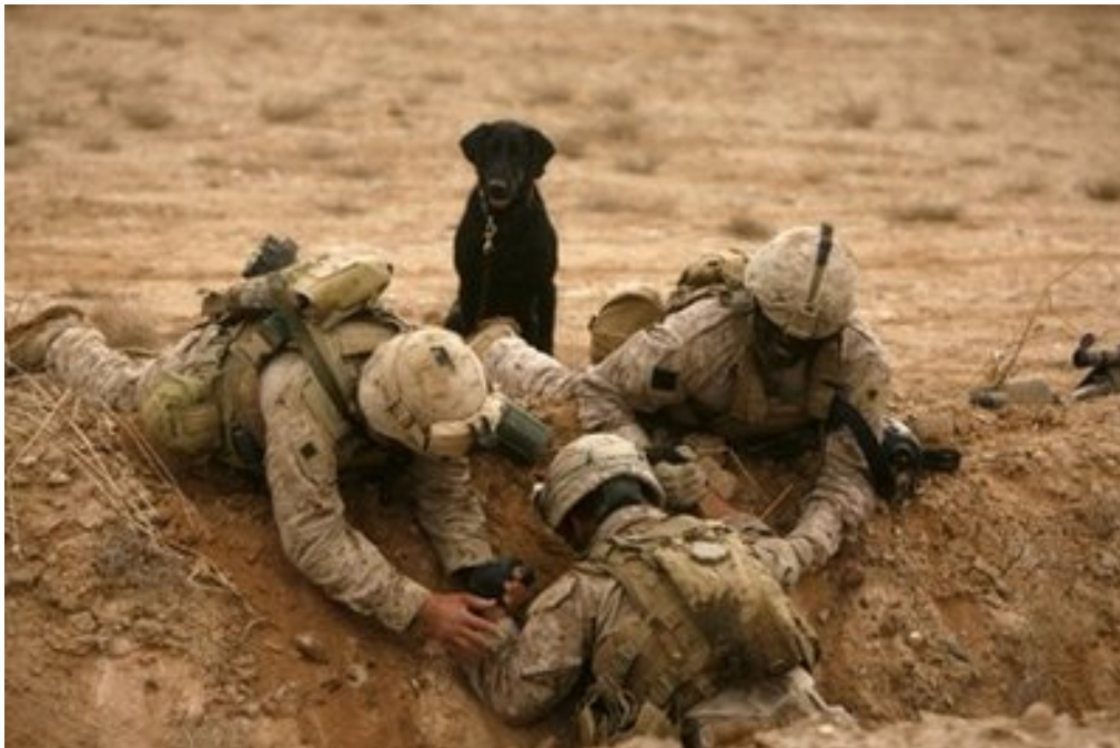
US Marines help a comrade who fell into a poppy field irrigation canal during a patrol around Marjah on February 24.