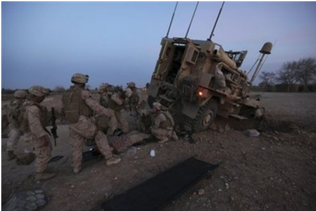
Marines gather around their wounded comrade after extraction.