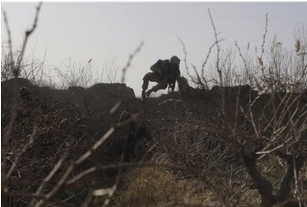
U.S. Marines from 3rd Battalion, 6th Marine Regiment move as Taliban fighters fire on them in the town of Marjah in Afghanistan's Helmand province on Feb. 15, 2010.