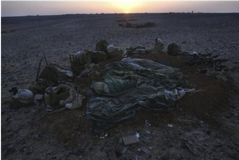
U.S. Marines sleep in firing positions at a forward camp outside Marjah in Afghanistan's Helmand province Feb. 12, 2010.