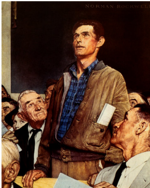
Freedom of Speech: Norman Rockwell, 1943

“Where And When Did We Lefties Lose This Vital Part Of Our Social Language?”