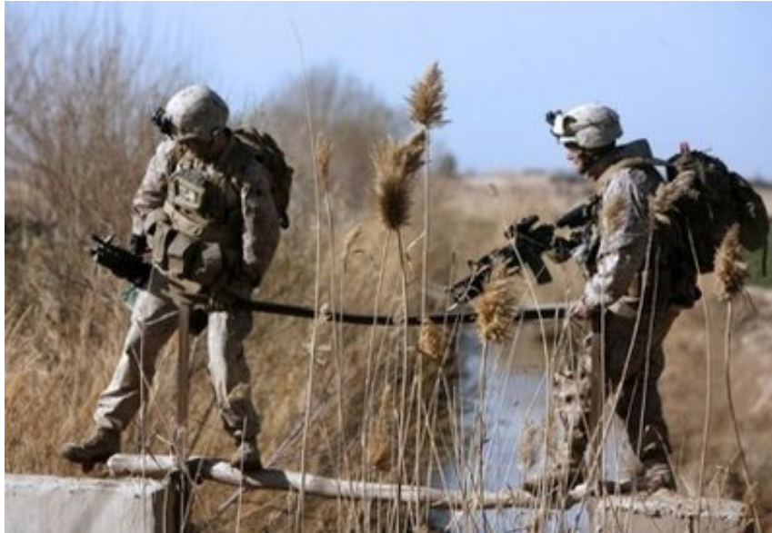
Feb 11: US Marines patrol on the outskirts of Marjah.