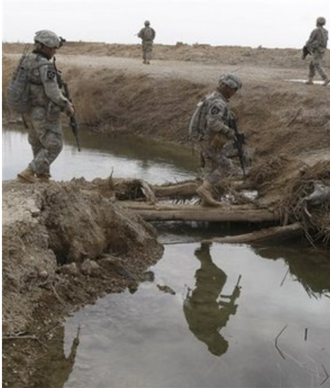
U.S. soldiers of the 4th Battalion, 23rd Infantry Regiment, 5th Brigade, 2nd Infantry Division West of Lashkar Gah in Helmand province, southern Afghanistan, Feb. 12, 2010.