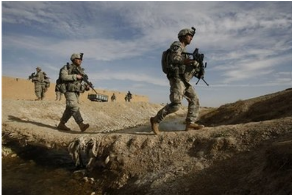
U.S. soldiers of the 4th Battalion, 23rd Infantry Regiment, 5th Brigade, 2nd Infantry Division, west of Lashkar Gah in Helmand province, southern Afghanistan, Feb. 12, 2010.