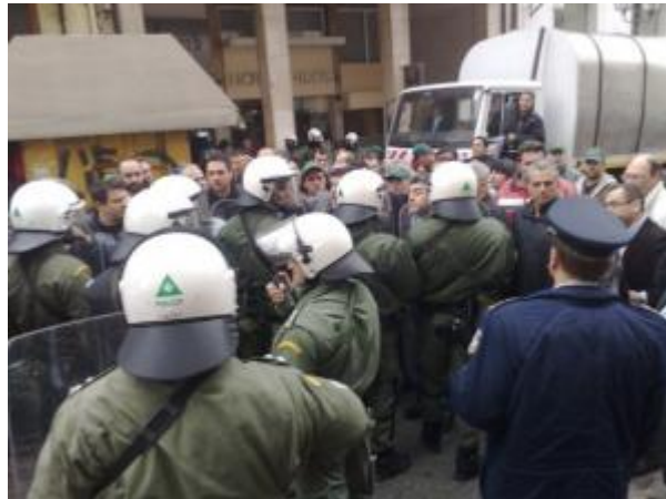
Sanitation workers use garbage truck to press against police blockade.

Their strike coincided with the release of a national statistics service report which revealed that unemployment rose to a five-year high of 10.6 per cent in November 2009, up from 9.8 per cent in October.