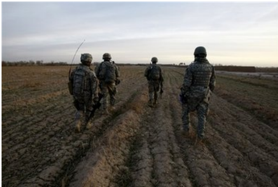
U.S. Army soldiers of the 2nd Infantry Division, and their interpreter, right, on a patrol in a village West of Lashkar Gah in Helmand province, Southern Afghanistan, Feb. 10, 2010.