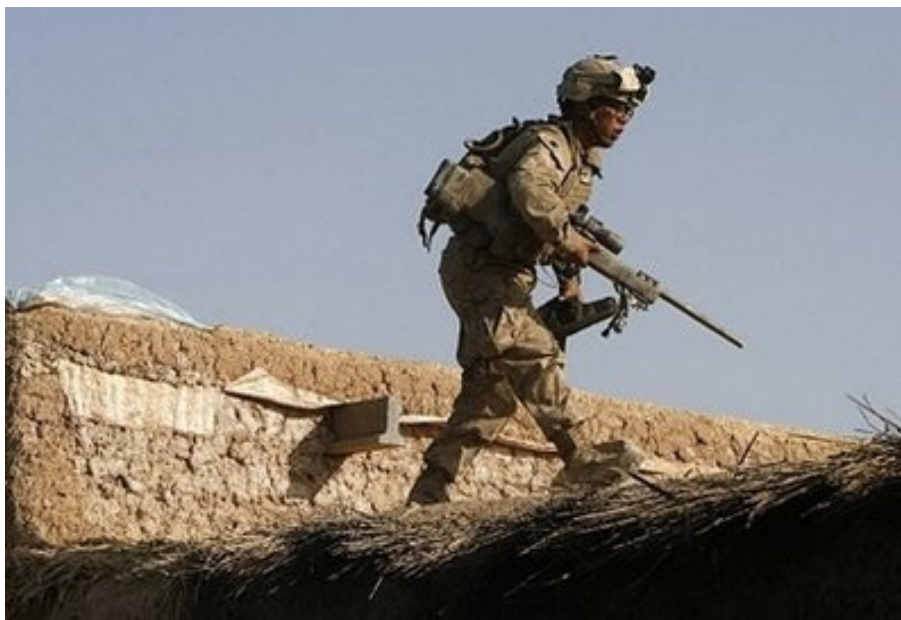
2.13.10: A sniper with US Marines 1/3 Charlie company crosses a rooftop on the northeast of Marjah.