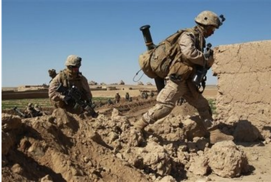
U.S. Marines from 3rd Battalion, 6th Marine Regiment walk past a mud wall they blew open as they enter Marjah in Afghanistan's Helmand province Feb. 13, 2010.