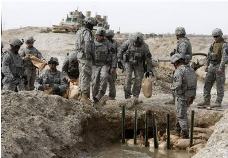
U.S. soldiers of the 562 Engineer Company, 5th Brigade, 2nd Infantry Division, work on a bridge over a canal west of Lashkar Gah in Helmand province, southern Afghanistan, Feb. 11, 2010.