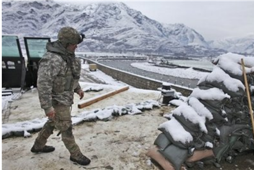
A U.S. Army soldier on guard duty at Forward Operating Base Blessing, in the Pech Valley, Kunar province, northeastern Afghanistan, Jan. 29, 2010.