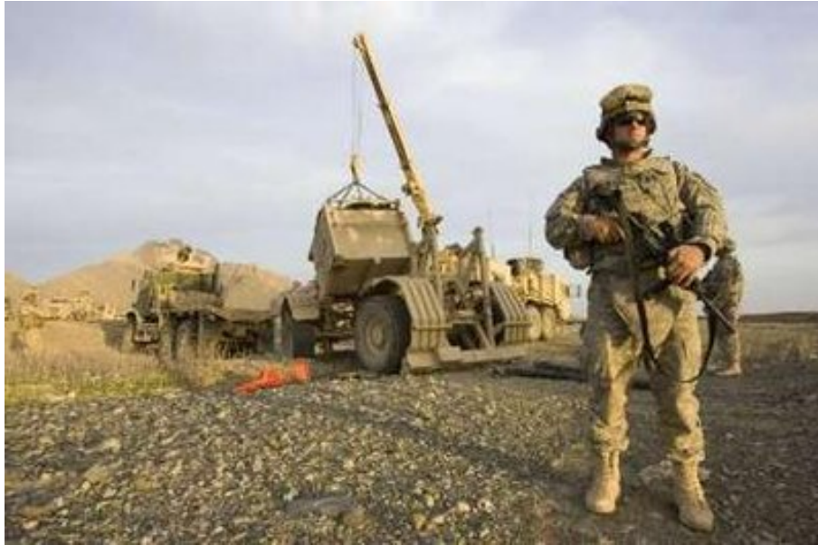
A soldier belonging to the Army National Guard 162 Engineer Company attached to the 2nd Combat Engineer Battalion of U.S. Marine Corps secures the area around a broken vehicle in a convoy delivered supply to the remote Forward Operating Base (FOB) Cafferata in Helmand province, southern Afghanistan, March 8, 2010. Picture taken March 8, 2010.