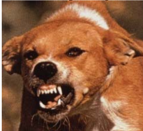
Nouri Kamel al-Maliki: نوري كامل المالكي

Maliki’s critics say the Shiite prime minister is using state security forces and the courts to remove political rivals in a last-ditch effort to disqualify candidates from Allawi’s Iraqiya coalition, which holds only a two-seat lead ahead of Maliki’s State of Law bloc.