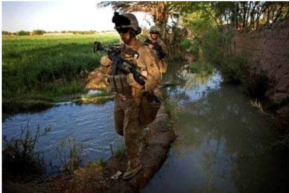
U.S. Marine with the First Battalion, Sixth Marine Regiment, Alpha company patrol in Marjah, Afghanistan, March 18, 2010.