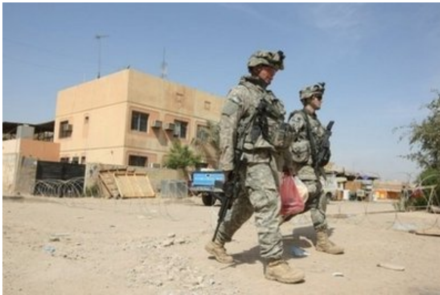
US soldiers patrol the Independent High Electoral Commission (IHEC) headquarters in Baghdad on March 8.

The US armed forces are only visible in their giant helicopters gunships, or while escorting diplomats, ramming through the city in their armoured Chevrolets.