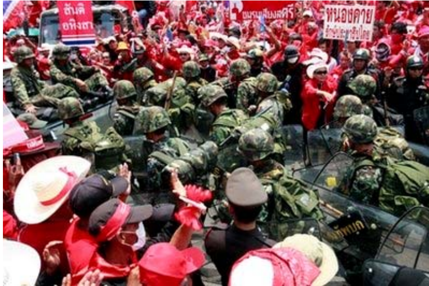
Protesters cheer and offer flowers to the soldiers as they retreat from their temporary base, March 27, 2010 in Bangkok, Thailand. Thousands of protesters marched to seven temporary bases comprising schools and temples and asked the soldiers to abandon their bases and return to their barracks.