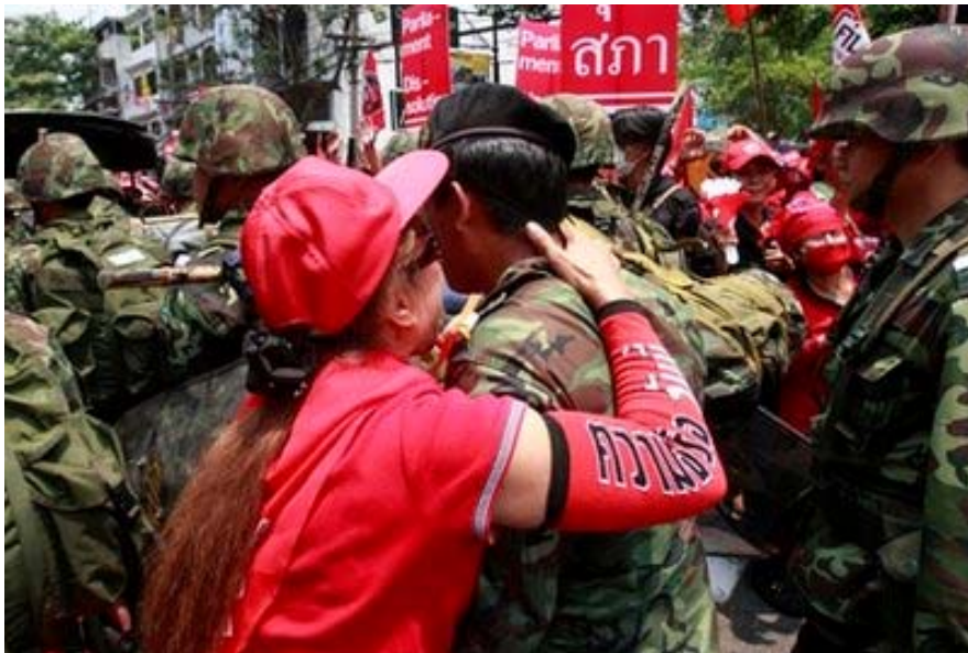
A protester kisses and thanks a soldier for retreating from a temporary base in Bangkok, Thailand, March 27, 2010.