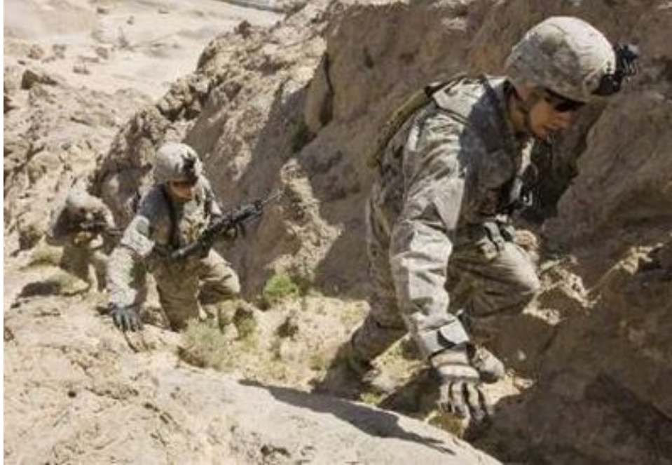
Soldiers with the 508th Special Troops Battalion, 82nd Airborne Division outside the town of Kandahar, southern Afghanistan March 27, 2010.