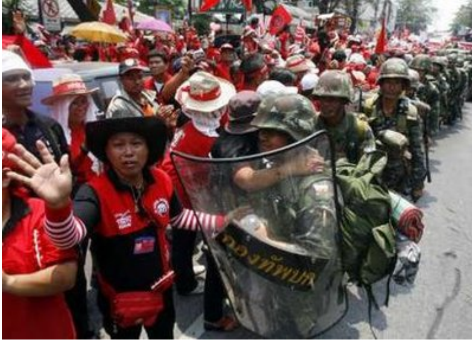
A marcher hugs a Thai soldier in Bangkok March 27, 2010.