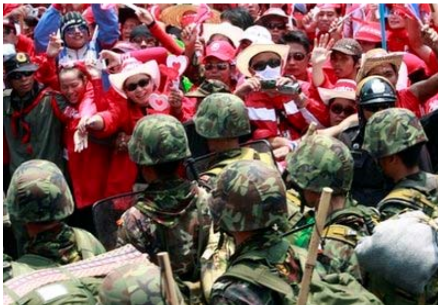
Protesters cheer the soldiers as they leave their temporary base following the pressure from protesters March 27, 2010 in Bangkok, Thailand. Thousands of protesters marched to seven temporary bases comprising schools and temples and ask the soldiers to abandon their bases and return to their barracks.