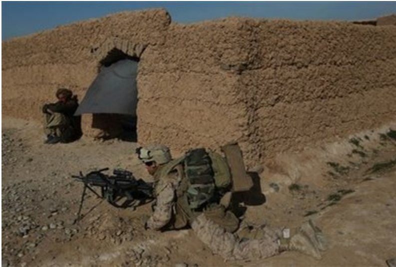
A U.S. Marine on patrol in Marjah in Afghanistan's Helmand province Friday, Feb. 19, 2010.