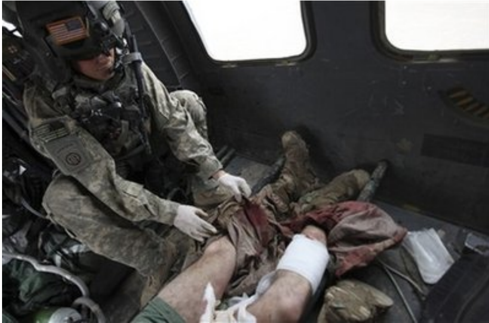
During a medevac flight, a U.S. Army Task Force Pegasus Crew Chief helps attend to a U.S. Marine wounded in Marjah, Helmand province, Afghanistan, March 2, 2010.