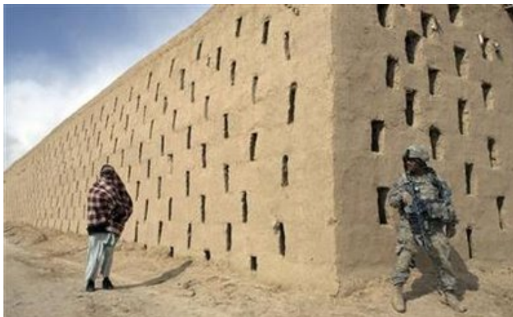
U.S. army soldier patrols near the town of Shah joy in Zabul province, southern Afghanistan, February 14, 2010.

GUESS WHO'S WORRIED GUESS WHO ISN'T ALL HOME NOW