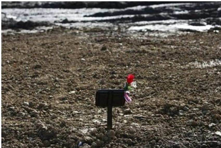
Section 60 at Arlington National Cemetery in Arlington, Va., March 4, 2010, as the surrounding earth is groomed and prepared for troops killed in the wars on Afghanistan and Iraq.