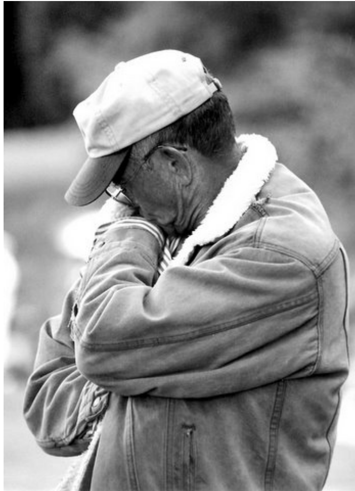
Vietnam veteran in grief while at the Vietnam Veterans Memorial in Portland, Oregon 1988.