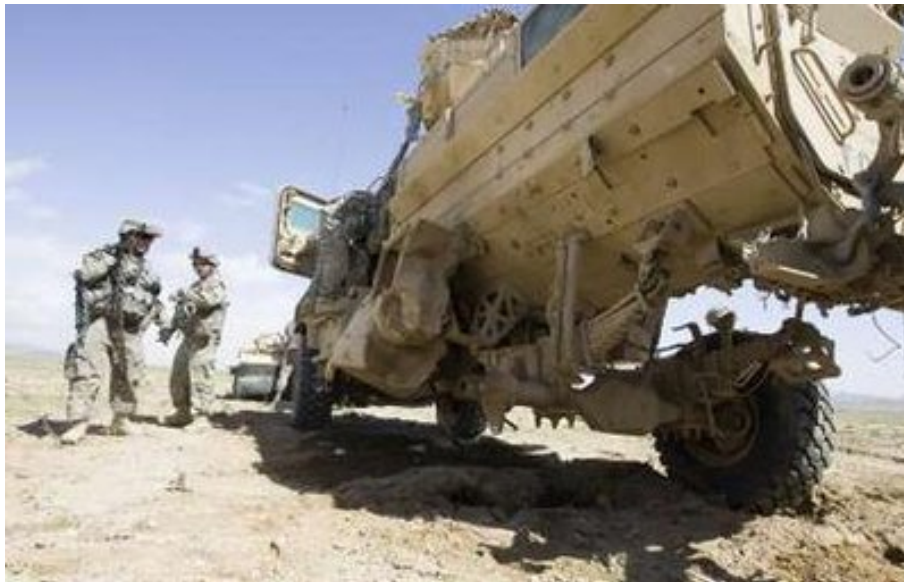
A Mine Resistant Ambush Protected (MRAP) armored vehicle is left with a missing wheel after a hit by a road side bomb while providing a route clearance for a convoy delivering supplies to the remote U.S. Marine base in Helmand province, southern Afghanistan, March 6, 2010.