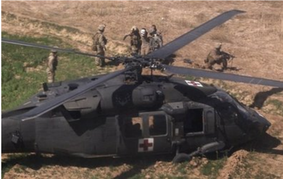
A medevac mission picks up a U.S. Marine wounded by an IED blast in Marjah, Helmand province, Afghanistan, March 6, 2010.

NOT ANOTHER DAY NOT ANOTHER DOLLAR NOT ANOTHER LIFE