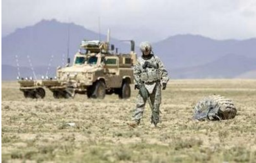
Near part of a wheel blown off by the explosion, a member of the U.S. Air Force bomb squad searches for pieces of MRAP hit by road side bomb, March 6, 2010.