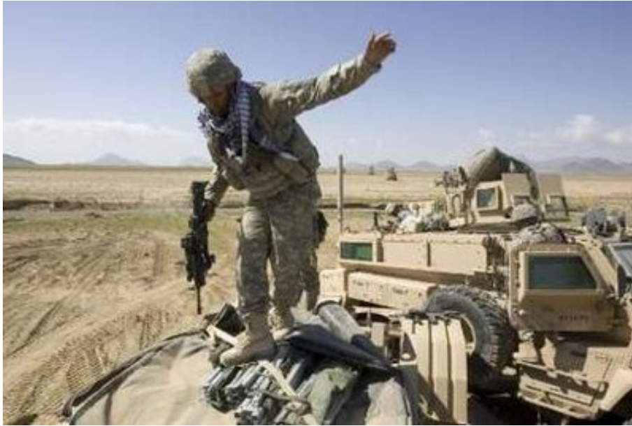
Soldiers of the Army National Guard 162 Engineer Company attached with 2nd Combat Engineer Battalion of U.S. Marine Corps evacuate from their Mine Resistant Ambush Protected (MRAP) armored vehicle after it was hit by a roadside bomb while providing a route clearance for a convoy March 6, 2010.