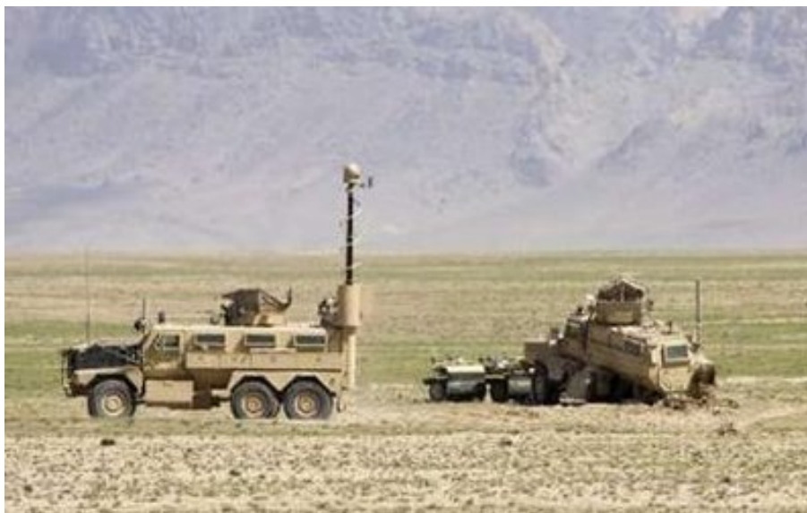
Remains of the MRAP vehicle on right March 6, 2010.