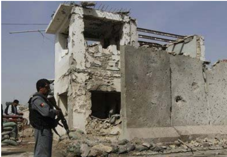
The damaged wall of the police headquarters in Kandahar March 14, 2010.

[Thanks to Sandy Kelson, Military Resistance, who sent this in.