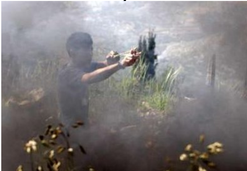
A Palestinian boy uses sling shot against Zionist border police during clashes in the occupied Palestinian West Bank village of Iraq Burin near Nablus March 13, 2010.