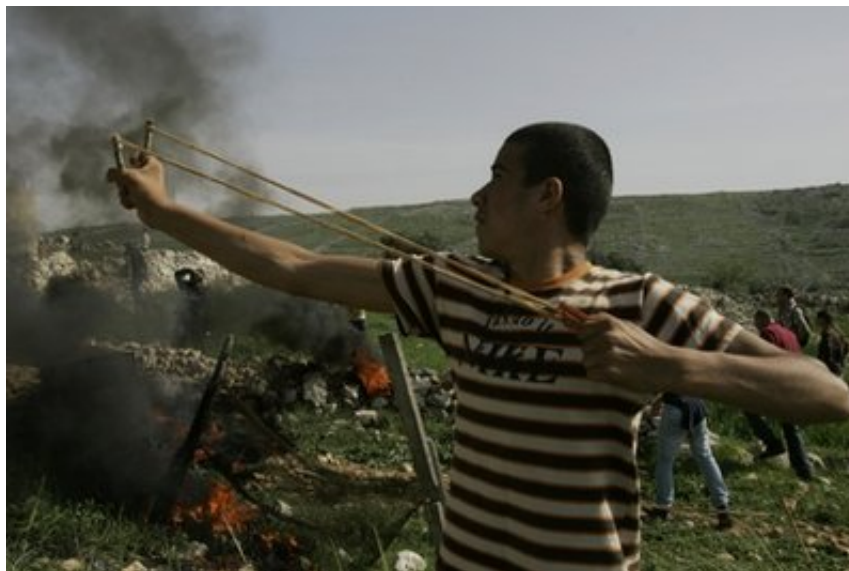
A Palestinian boy uses a slingshot against Zionist soldiers during clashes in the occupied Palestinian West Bank village of Iraq Burin, near Nablus, March 13, 2010. Residents of the village said they tried to prevent Zionist occupiers from bathing in a water cistern they depend on for agriculture. The Zionist soldiers attacked with tear gas and rubber coated steel bullets, injuring Palestinians, medics said.