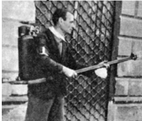
A resistance fighter with a homemade flame thrower during the Warsaw Ghetto Uprising.