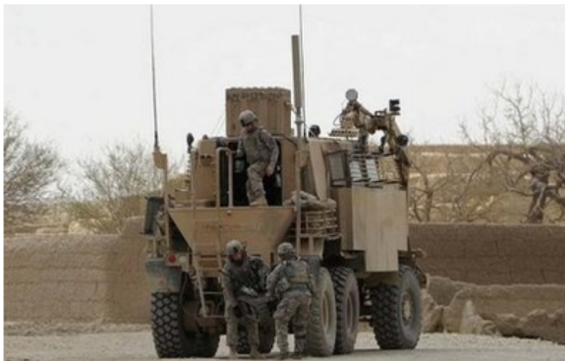
Apr 2: US Army soldiers unload a robot to deactivate an IED they discovered on a main road in Yosef Khel district of Paktika province, Afghanistan.