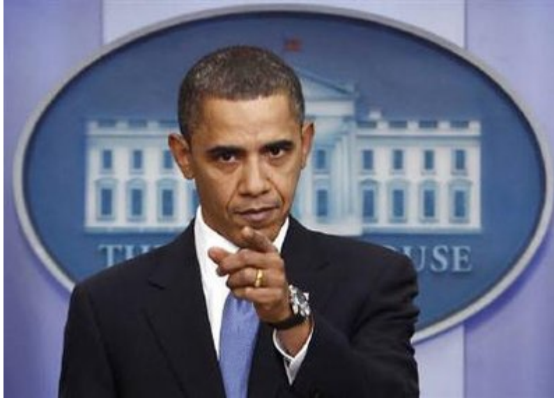
February 9, 2010.