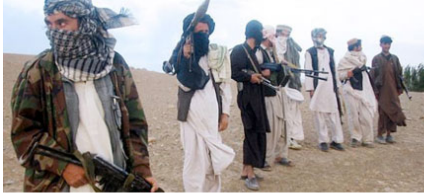
Taliban fighters on a hillside at Maydan Shahr, west of Kabul, Afghanistan, 04/04/09.