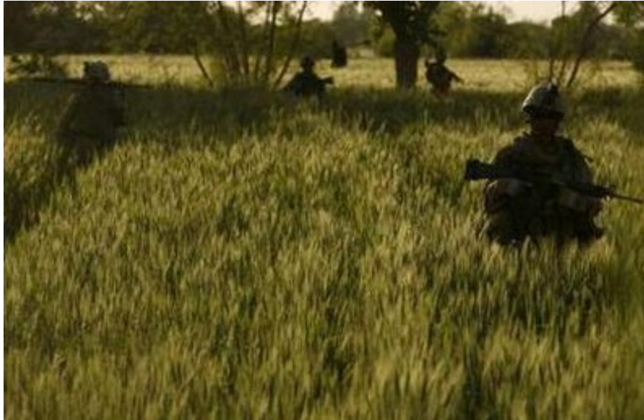
U.S. Marines 6th Marines patrol around Karez-e-Sayyidi, in Helmand province, April 4, 2010.