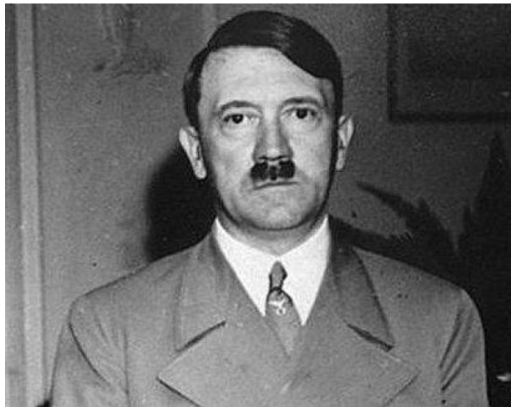
Am 30. Januar 1933 wurde Adolf Hitler als Reichskanzler vereidigt.