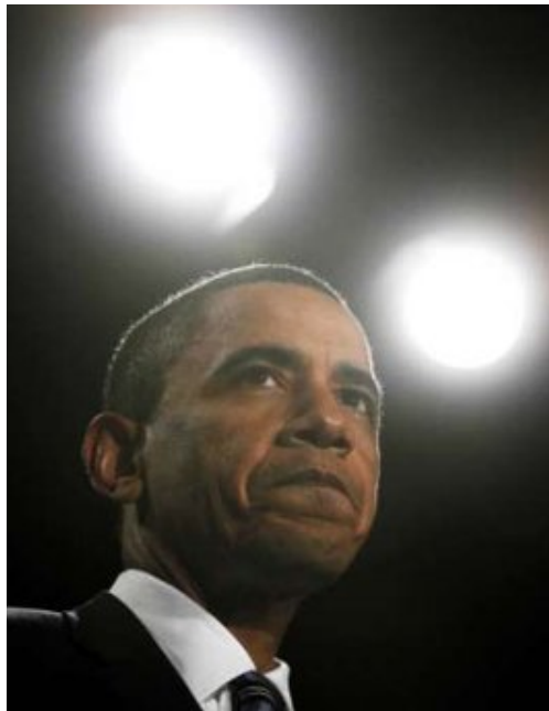
Obama March 10, 2010.

LOYAL TOOL OF THE RICH AND POWERFUL: UNFIT FOR COMMAND; UNWORTHY OF OBEDIENCE: DOMESTIC ENEMY OF THE LIBERTIES OF AMERICAN CITIZENS