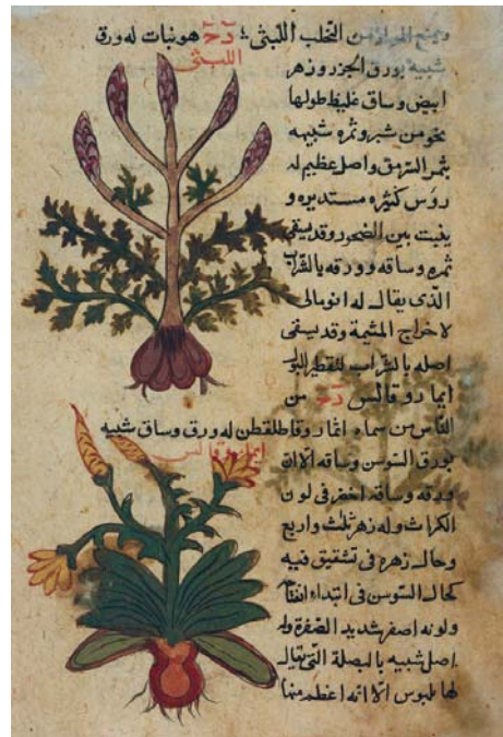
Islamic roots: Archivo Iconografico, S.A./Corbis

[To answer the reader's question: Sorry, no Islamic roots available here. but the graphic following may be helpful in your search. T]