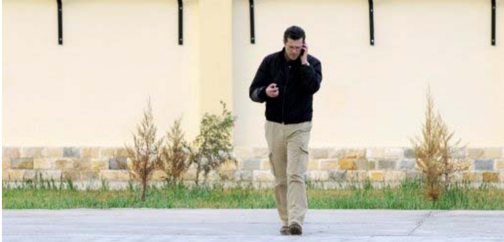
Defense Minister Karl-Theodor zu Guttenberg received the news of the attack “with shock” upon landing at Termez, Uzbekistan on Thursday.

Until now, many people thought that training Afghan forces was practically the ideal task for the Bundeswehr, given popular opposition to the German mission and the fact that the Bundestag mandate for Germany’s forces excludes them from conducting offensive operations.