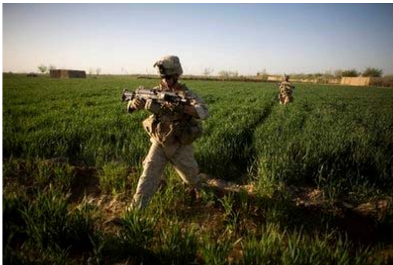
Marine patrols in Marjah, Afghanistan, March 17, 2010.

WELCOME TO AFBAGHVIETISTAN: HAVE A NICE DAY