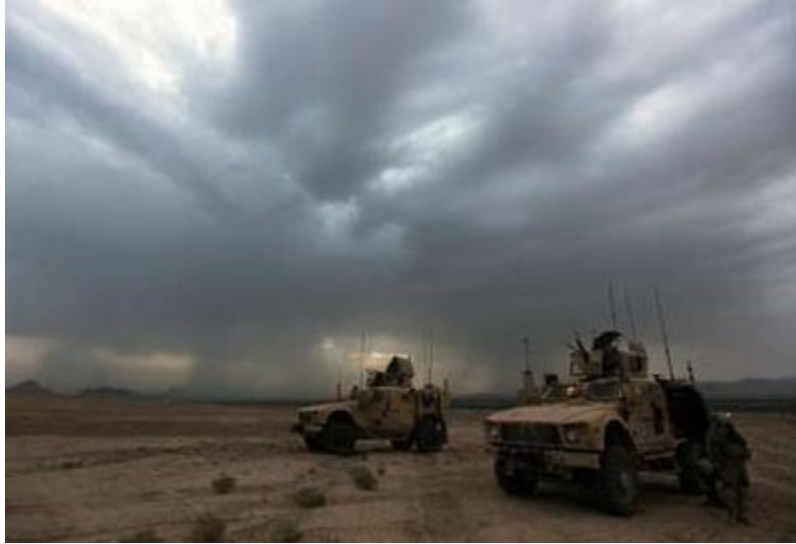
U.S. Army soldiers with Delta Company 2nd Battalion, 508th Parachute Infantry Regiment patrol at the Arghandab valley near Kandahar, in southern Afghanistan, May 4, 2010.