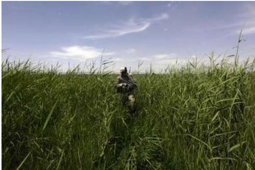
A U.S. soldier in a swamp by the Arghandab river, Kandahar province, southern Afghanistan, May 11, 2010.