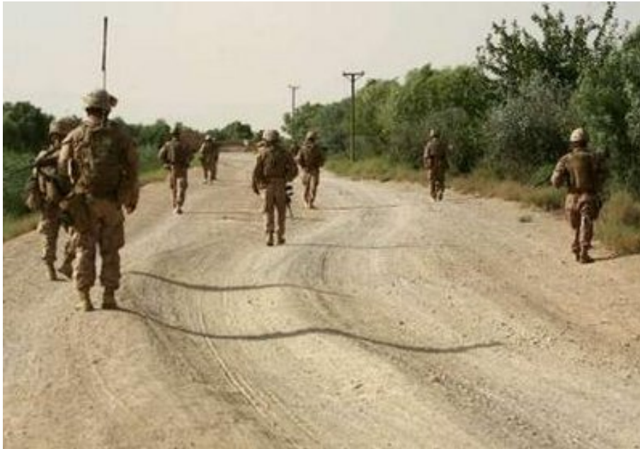
U.S. marines patrol in Marjah district, Helmand province, May 19, 2010.