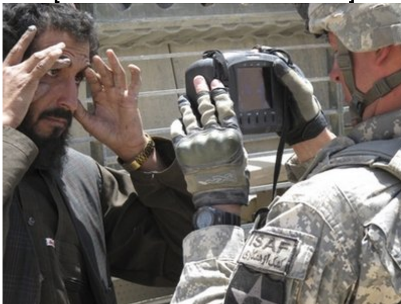
May 10, 2010: A U.S. soldier photographs an Afghan citizen stopped at a checkpoint near Forward Operating Base Frontenac in Shah Wali Kot district of Afghanistan. The photograph of the man's iris will be entered into a biometrics identification system.