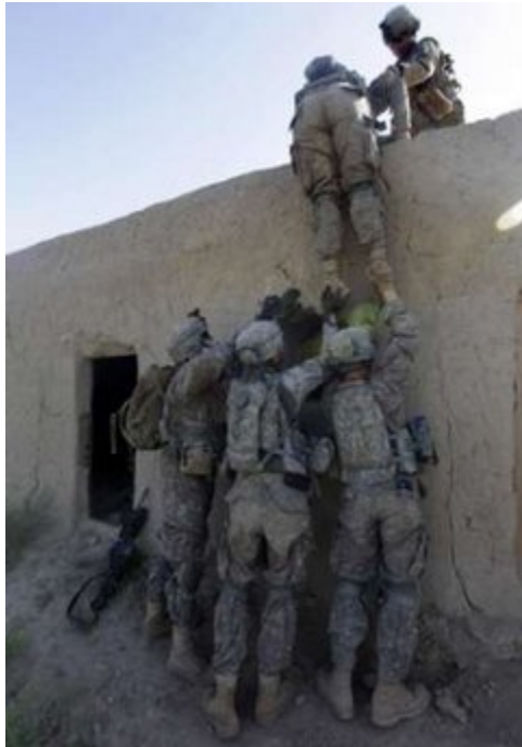
U.S. Army soldiers with the 2nd Battalion, 508th Parachute Infantry Regiment, part of the 82nd Airborne Division in Mian Joie village during a security operation in Arghandab valley in Kandahar province, southern Afghanistan, May 10, 2010.