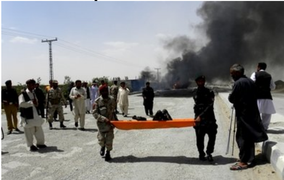
Pakistani security officials carry a dead body of a man near a burning military supply oil tanker in Chaman near the Pakistan-Afghanistan border May 12, 2010, in Pakistan.