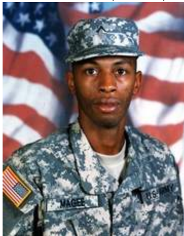
Magee (Submitted photo)