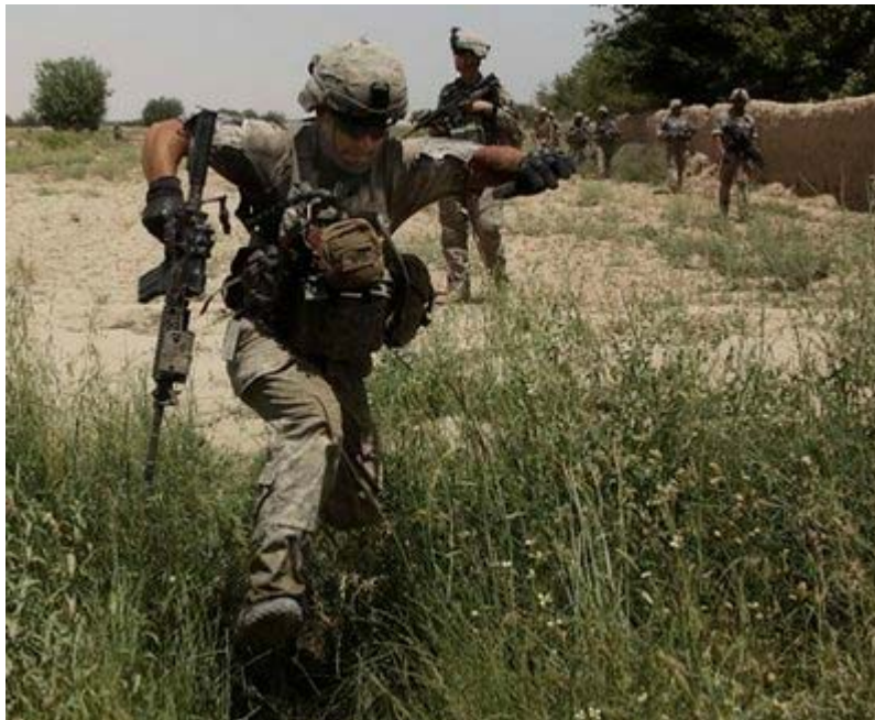
A U.S. soldier crosses an irrigation ditch while on patrol with 2nd Platoon, Alpha Company, 2nd Battalion, 1st Infantry Regiment of the 5th Stryker Brigade, May 8, 2010, in Afghanistan's Kandahar province.