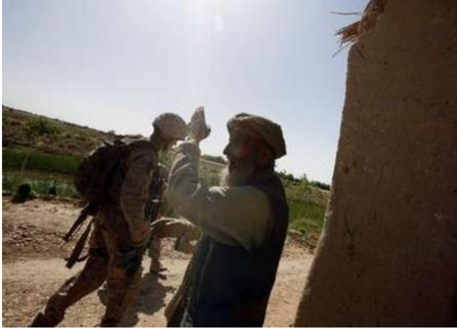
An Afghan civilian shouts as he tells U.S. Marines to get out of his compound while they patrol in the area of Karez-e-Sayyidi in the outskirts of Marjah district, Helmand province, May 10, 2010.