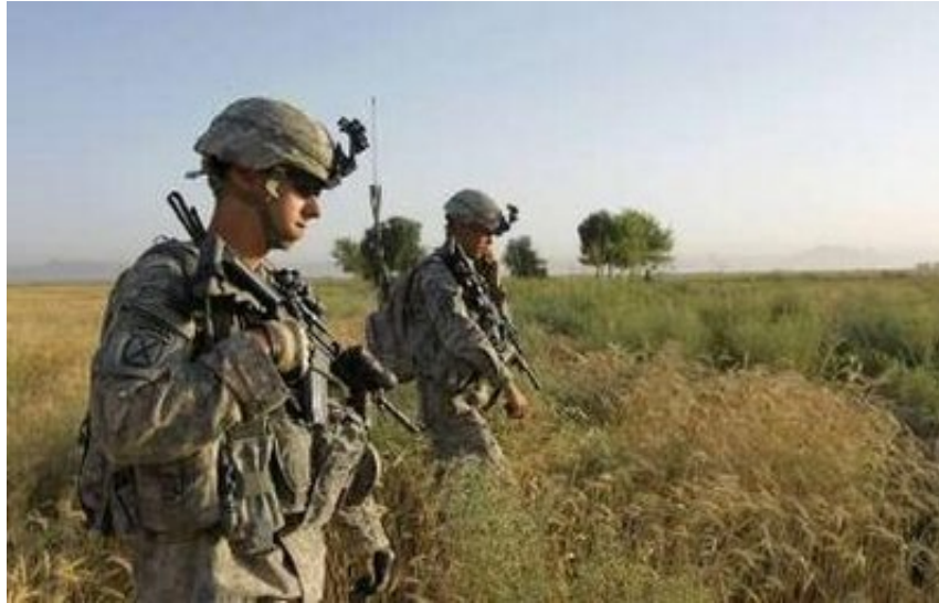
U.S. soldiers with C Troop 1-71 CAV, patrol outside the village of Maruf-Kariz in Dand district, south of Kandahar, June 19, 2010.