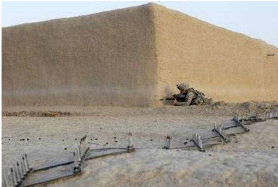
U.S. soldier secures a road covered with road spikes at a temporary checkpoint in Dand district, south of Kandahar, June 21, 2010.

IF YOU DON'T LIKE THE RESISTANCE END THE OCCUPATIONS