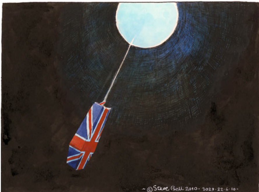
Steve Bell on the 300th British fatality in Afghanistan: 22 June 2010