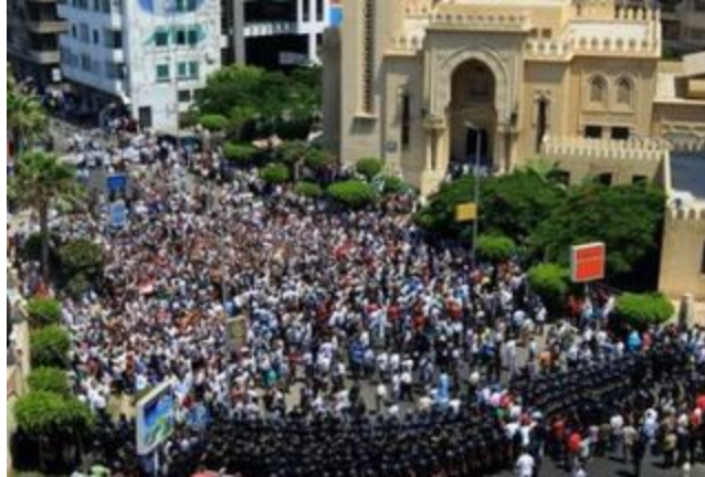
Friday's protest in Alexandria