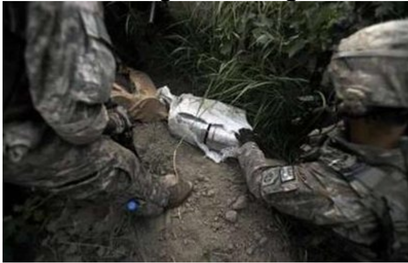
US Army soldiers with the 82nd Airborne Division unearthen a cache of explosive materials in the village of Kuhakin Arghandab District, north of Kandahar July 7, 2010.

THERE IS ABSOLUTELY NO COMPREHENSIBLE REASON TO BE IN THIS EXTREMELY HIGH RISK LOCATION AT THIS TIME, EXCEPT THAT THE PACK OF TRAITORS THAT RUN THE GOVERNMENT IN D.C. WANT YOU THERE TO DEFEND THEIR IMPERIAL DREAMS: That is not a good enough reason.