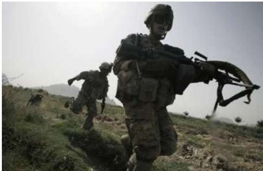
U.S. soldiers with the 67th Engineer Detachment during a battle with Taliban militants near the village of Jilga in Arghandab District north of Kandahar July 8, 2010.