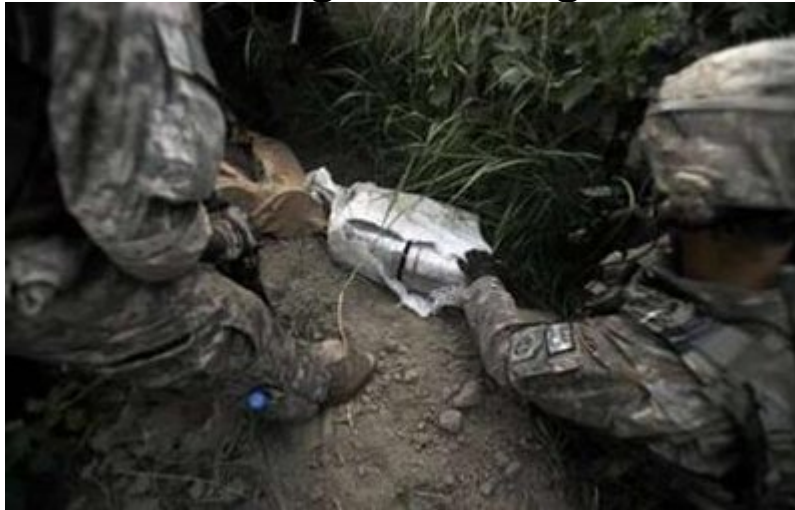
US Army soldiers with the 82nd Airborne Division unearh a cache of explosive materials in the village of Kuhakin Arghandab District, north of Kandahar July 7, 2010.

THERE IS ABSOLUTELY NO COMPREHENSIBLE REASON TO BE IN THIS EXTREMELY HIGH RISK LOCATION AT THIS TIME, EXCEPT THAT THE PACK OF TRAITORS THAT RUN THE GOVERNMENT IN D.C. WANT YOU THERE TO DEFEND THEIR IMPERIAL DREAMS: That is not a good enough reason.