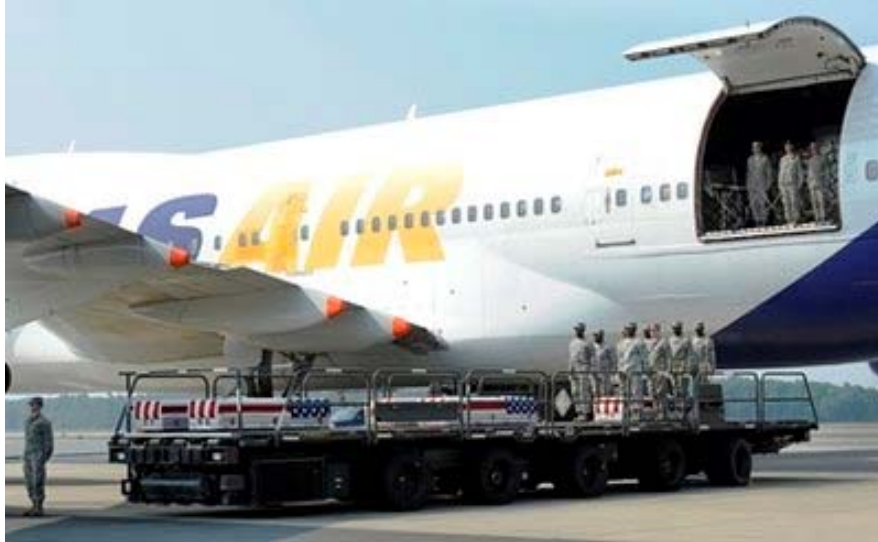
The remains of five Army soldiers at Dover Air Force Base, July 7, 2010. The five soldiers were killed in Afghanistan.

CHECK OUT THE NEW ISSUE OF TRAVELING SOLDIER JUST POSTED