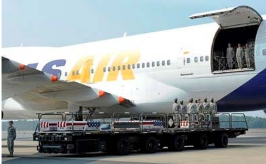
The remains of five Army soldiers at Dover Air Force Base, July 7, 2010. The five soldiers were killed in Afghanistan.

CHECK OUT THE NEW ISSUE OF TRAVELING SOLDIER JUST POSTED