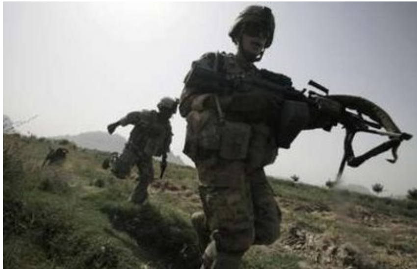
U.S. soldiers with the 67th Engineer Detachment during a battle with Taliban militants near the village of Jilga in Arghandab District north of Kandahar July 8, 2010.