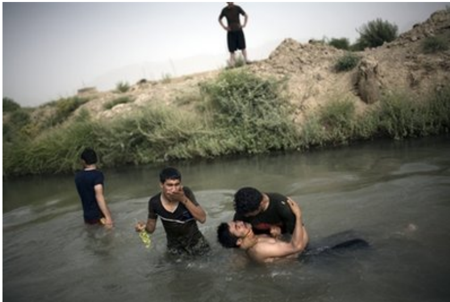
Afghan army soldiers share a special moment as they cool off from the fierce heat with a swim in a canal near a joint Afghan-U.S. base in the Arghandab Valley, Kandahar, Afghanistan, July 22, 2010.