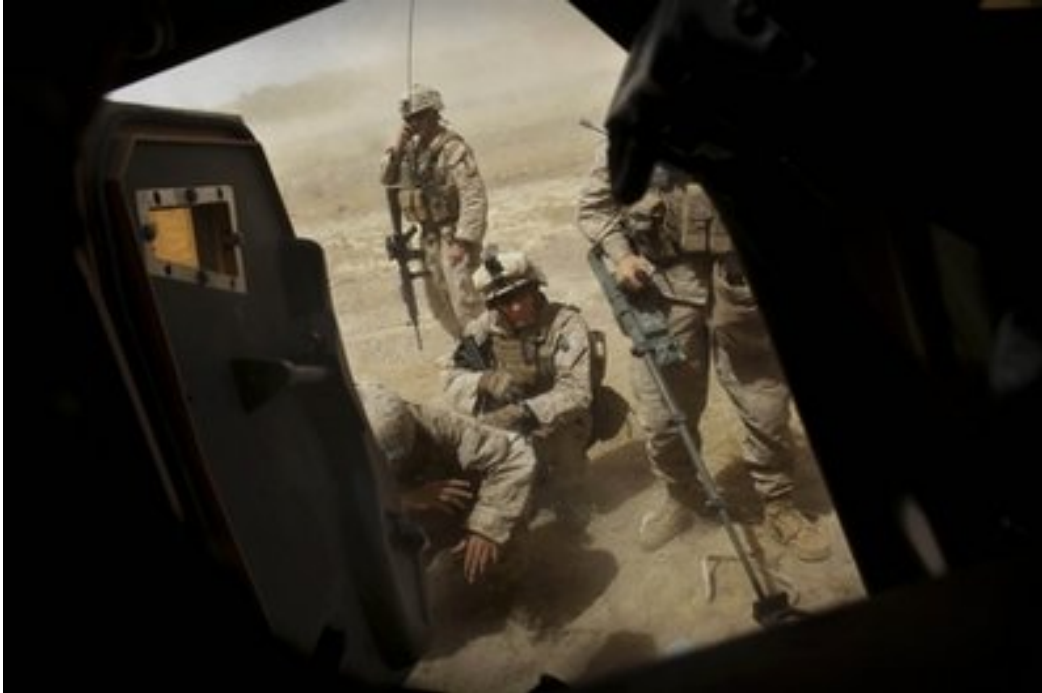
July 19, 2010: United States Marines of the 2nd Marines take cover outside their vehicle as a medevac helicopter leaves the scene with a wounded colleague following an IED strike near Musa Qaleh, in northern Helmand Province, southern Afghanistan.

“All The People In Our Area Are Happy With The Mujahideen. You Will Not Find Any Man In Any Village Who Has A Problem With Them”