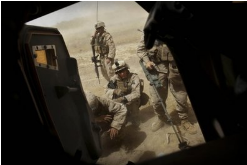
July 19, 2010: United States Marines of the 2nd Marines take cover outside their vehicle as a medevac helicopter leaves the scene with a wounded colleague following an IED strike near Musa Qaleh, in northern Helmand Province, southern Afghanistan.

“All The People In Our Area Are Happy With The Mujahideen. You Will Not Find Any Man In Any Village Who Has A Problem With Them”