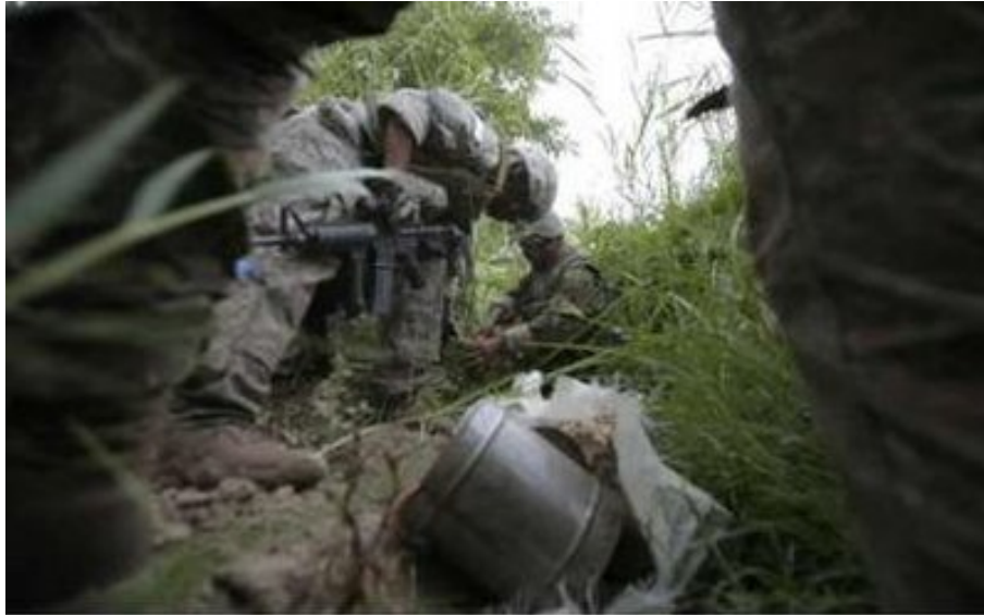
US Army soldiers with the 82nd Airborne Division unearth a cache of explosive materials in the village of Kuhakin, Arghandab District, north of Kandahar July 7, 2010.