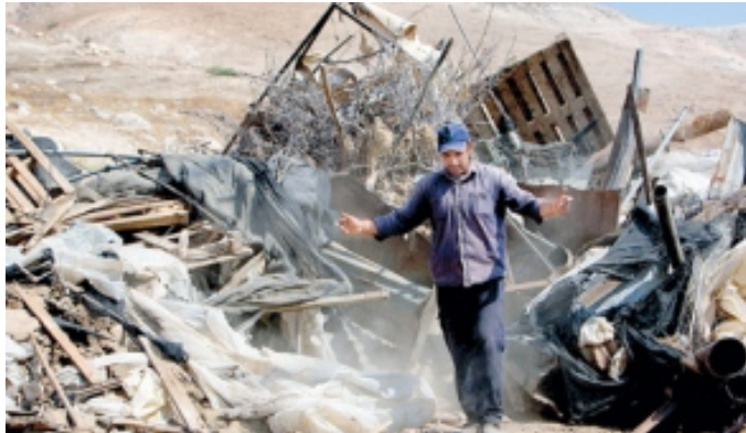
A Palestinian man inspecting the remains of his tent and belongings, destroyed by the Zionist military on July 19, 2010.