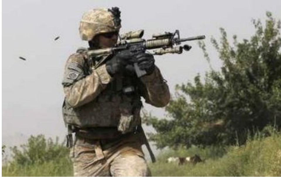
A U.S. soldier with 2-508 Parachute Infantry Regiment, 4th Brigade Combat Team, returns fire during a battle with Taliban militants near the village of Jilga in Arghandab District north of Kandahar July 8, 2010.