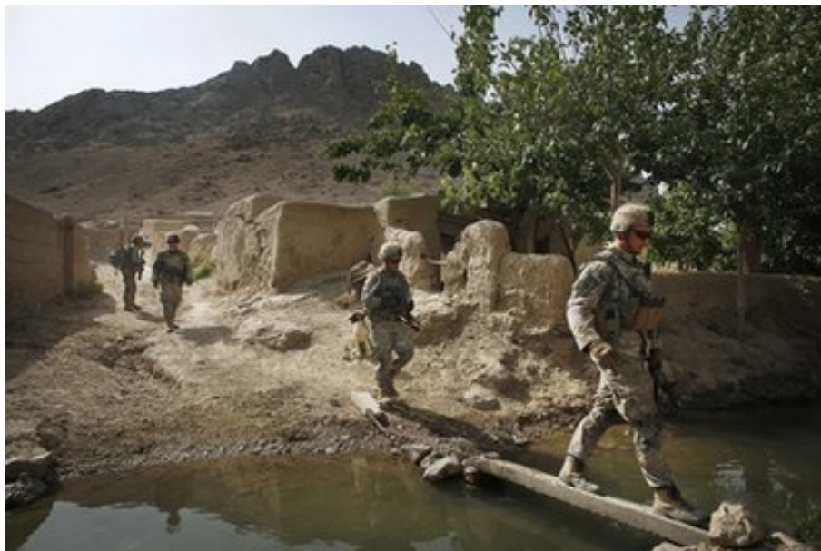
United States soldiers the 82nd Airborne patrol in the village of Pir-e-Paymal, Arghandab Valley, outside Kandahar City, July 7, 2010.