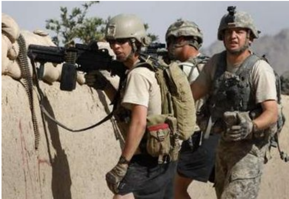
U.S. soldiers after receiving fire at Combat Outpost Nolen in the Arghandab Valley north of Kandahar, July 19, 2010.

IF YOU DON'T LIKE THE RESISTANCE END THE OCCUPATIONS