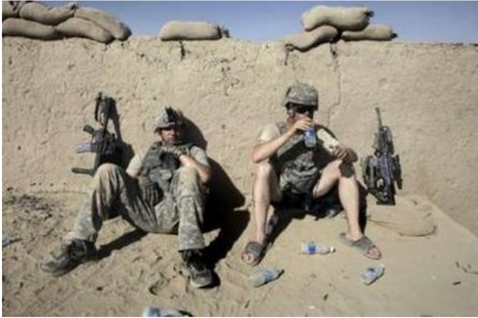
U.S. Army soldiers with the 1-320 Field Artillery Regiment, 101st Airborne Division after receiving incoming fire from Taliban militants at Combat Outpost Nolan in the Arghandab Valley north of Kandahar, July 19, 2010.