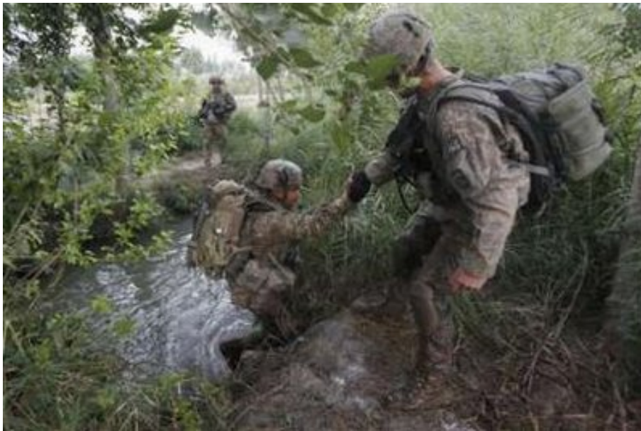
Soldiers with the US Army's 4th Brigade Combat Team during an early morning patrol in the village of Kuhak in Arghandab District, north of Kandahar July 9, 2010.