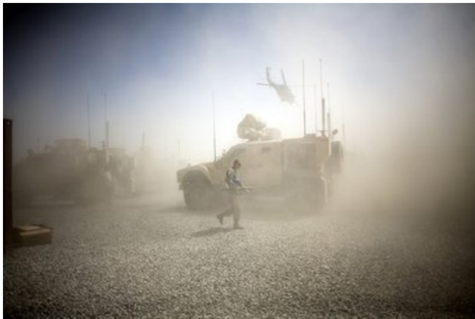
A U.S. soldier in dust whipped up by a departing helicopter at Combat Outpost Terra Nova in Kandahar, Afghanistan, July 19, 2010.