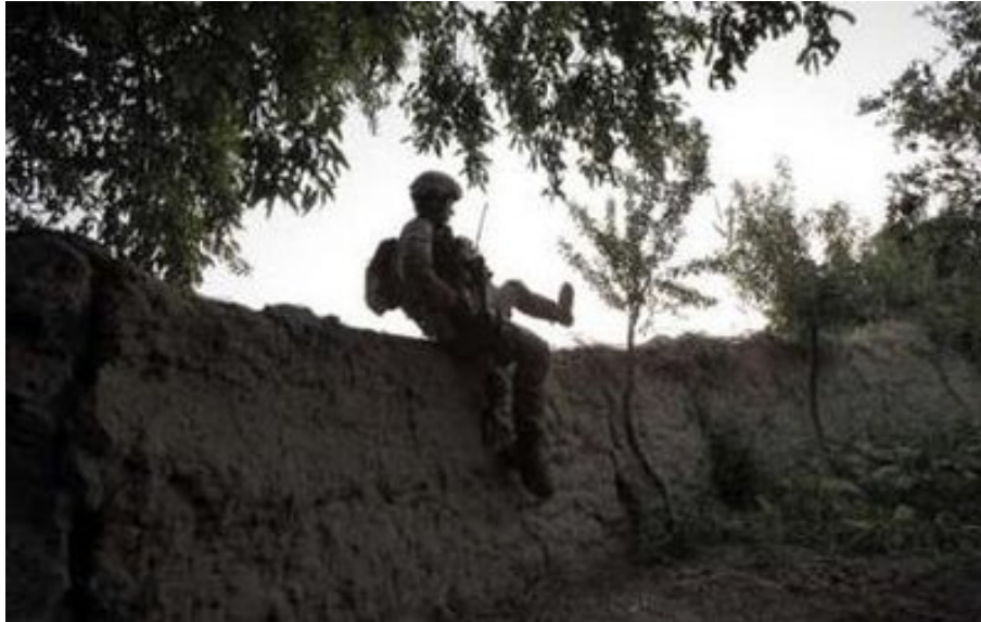
A US soldier with the 82nd Airborne Division on patrol in the village of Kuhak in Arghandab District, north of Kandahar July 7, 2010.