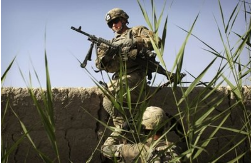
A United States soldier from the 82nd Airborne on patrol in the Arghandab Valley, outside Kandahar City, July 10, 2010.