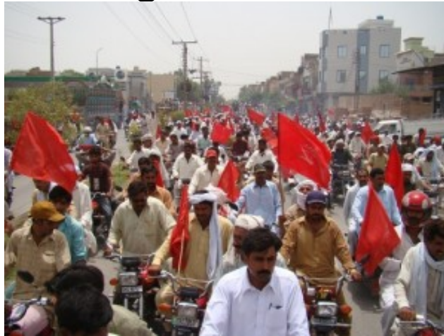
Workers Strike in Faisalabad, Pakistan

The media reported that the factory owner fired at the workers, injuring several. In retaliation workers burnt the factory.