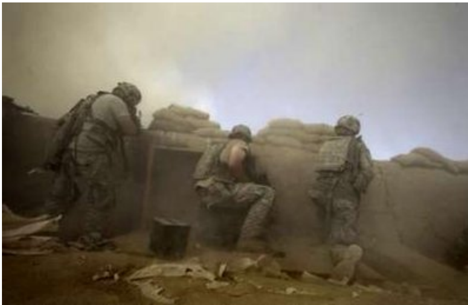
U.S. soldiers with the 101st Airborne Division are covered in dust as a Chinook helicopter lands outside their base during a firefight at Combat Outpost Nolan in the Arghandab Valley north of Kandahar, July 19, 2010.