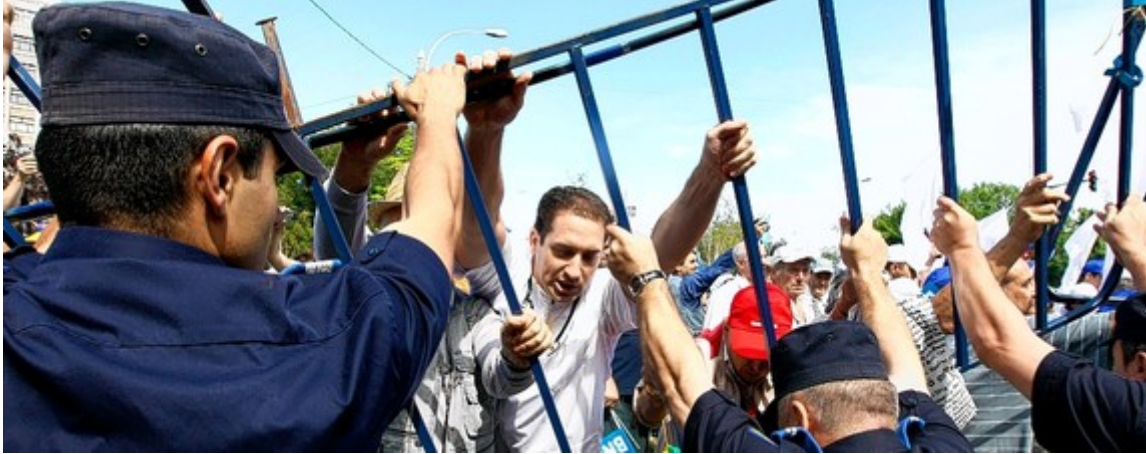
Protesters fight with riot police outside Romania's presidential palace in Bucharest on Friday.

JUNE 26, 2010 By GORDON FAIRCLOUGH, Wall St. Journal [Excerpts]