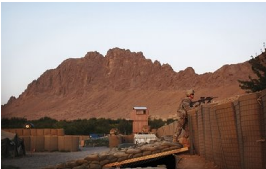
A United States soldier from the 508 Parachute Infantry Regiment of the 82nd Airborne, at Combat Outpost Ware in the Arghandab Valley, outside Kandahar City, July 4, 2010.