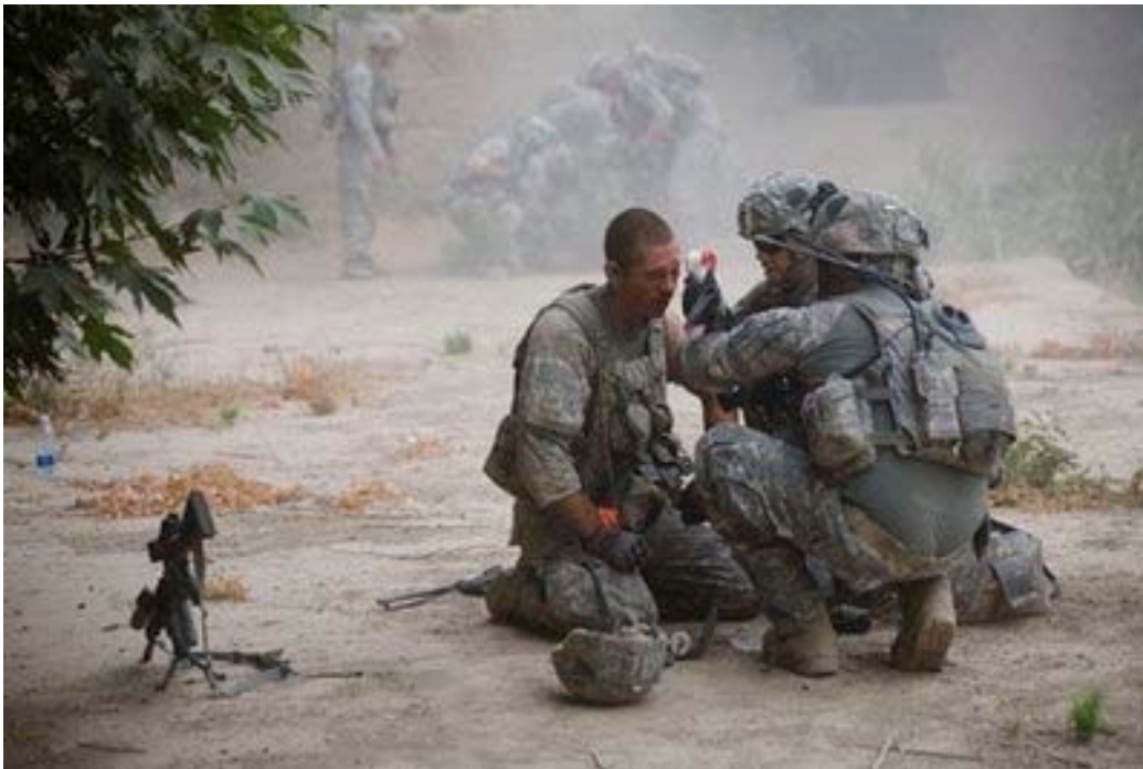
July 29, 2010: U.S. soldiers assist a comrade caught in the blast of an IED near COP Nolen, Arghandab Valley, Kandahar, Afghanistan.

IF YOU DON'T LIKE THE RESISTANCE END THE OCCUPATION