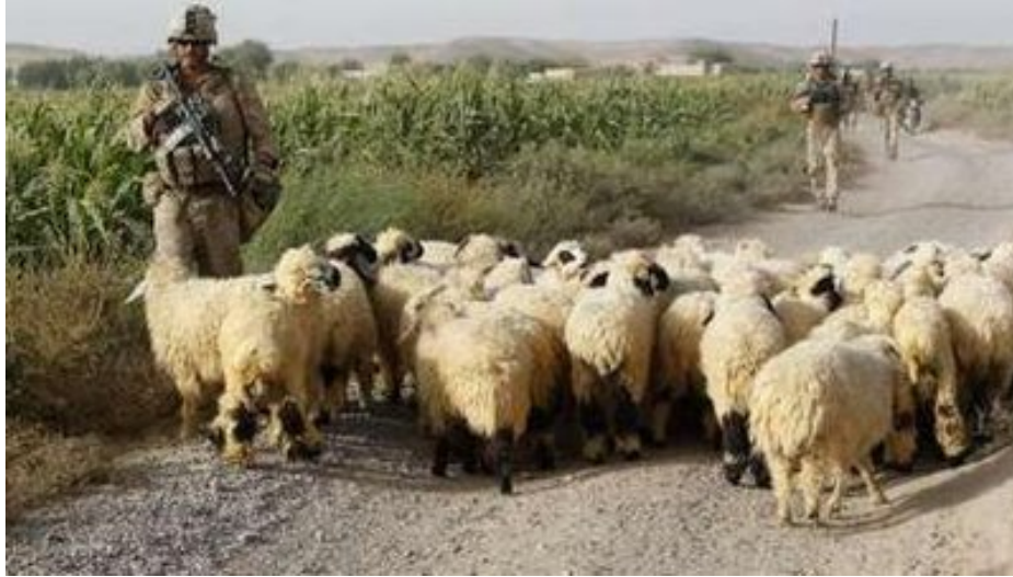
U.S. Marines from 1st Light Armoured Reconnaissance Battalion patrol in a village in Helmand September, 2010.