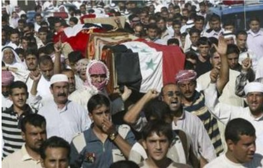
Falluja: Mourners carrying coffins curse U.S. armed forces during a funeral procession for people killed in a raid in Fallujah west of Baghdad, Iraq, Sept. 16, 2010.