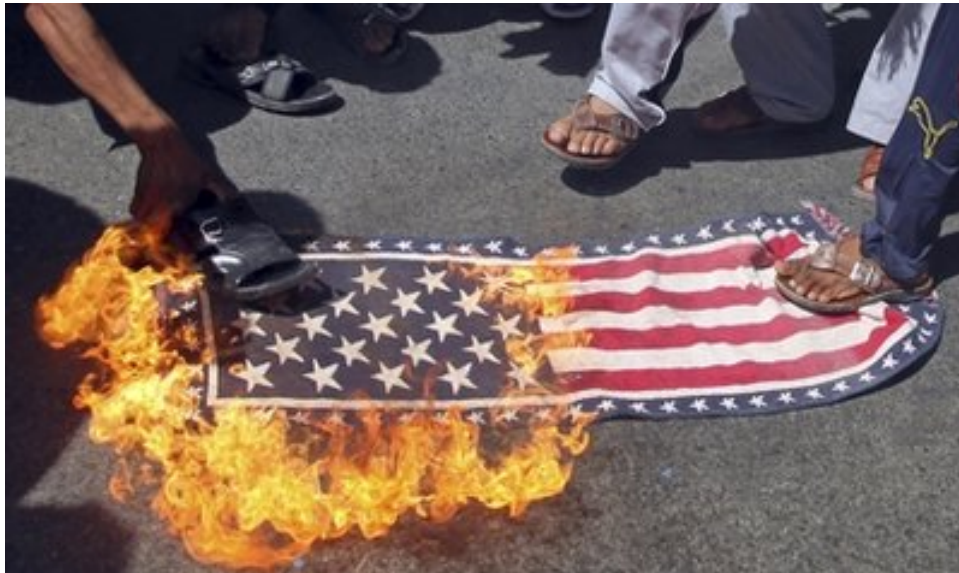
Iraqis politically aligned with anti-occupation nationalist Muqtada al-Sadr burn the U.S. flag in Sadr City in Baghdad, Iraq, Sept. 17, 2010.