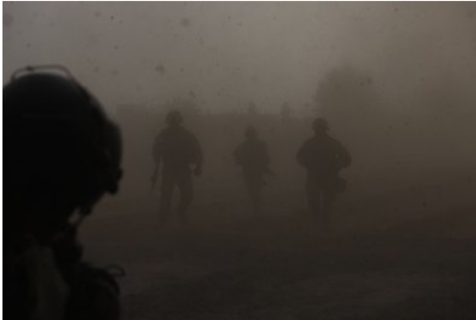
With fine, dense, airborne dust nearly blocking out the sunlight, U.S. Marines approach a U.S. Army medevac helicopter during the evacuation of a fellow Marine knocked unconscious when an improvised explosive device was detonated during a foot patrol, west of Lashkar Gah, in southern Afghanistan, Sept. 2, 2010.