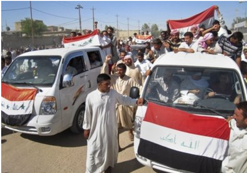
Falluja: Mourners yell condemnation of U.S. armed forces during a funeral procession for people killed in a raid in Fallujah west of Baghdad, Iraq, Sept. 16, 2010.

IF YOU DON'T LIKE THE RESISTANCE END THE OCCUPATION