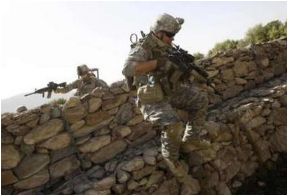
U.S. soldiers from Task Force 1-66, patrol along the bank of Arghandab River in Kandahar province September 9, 2010.