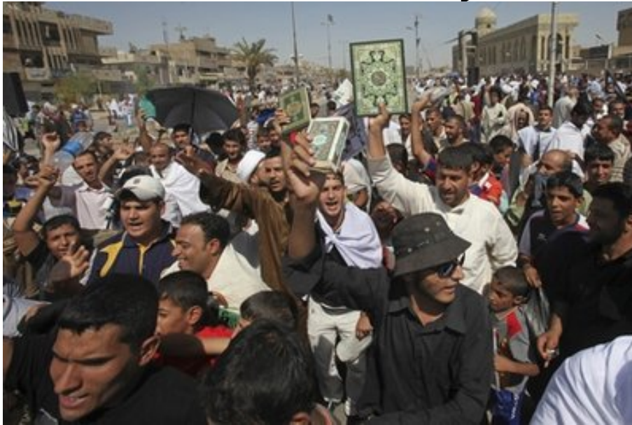
Iraqis politically aligned with anti-occupation nationalist Muqtada al-Sadr demonstrate against the U.S. military presence in Iraq after Friday prayers in Sadr City in Baghdad, Iraq, Sept. 17, 2010.