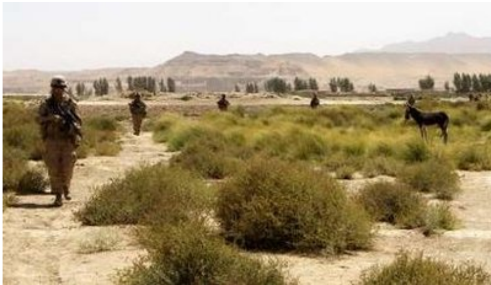
U.S. marines from 1st Light Armoured Reconnaissance Battalion patrol an area in Taghaz village in Helmand, Afghanistan September 9, 2010.