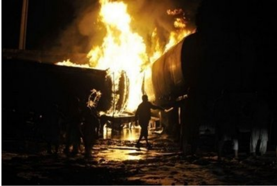
Burning military supply oil tankers for foreign troops in Afghanistan attacked by militants on the outside of Islamabad. Pakistani Taliban militants have claimed two fiery attacks on Afghanistan-bound supply convoys in which nearly 60 trucks have been torched in three days -- and vowed more to come.