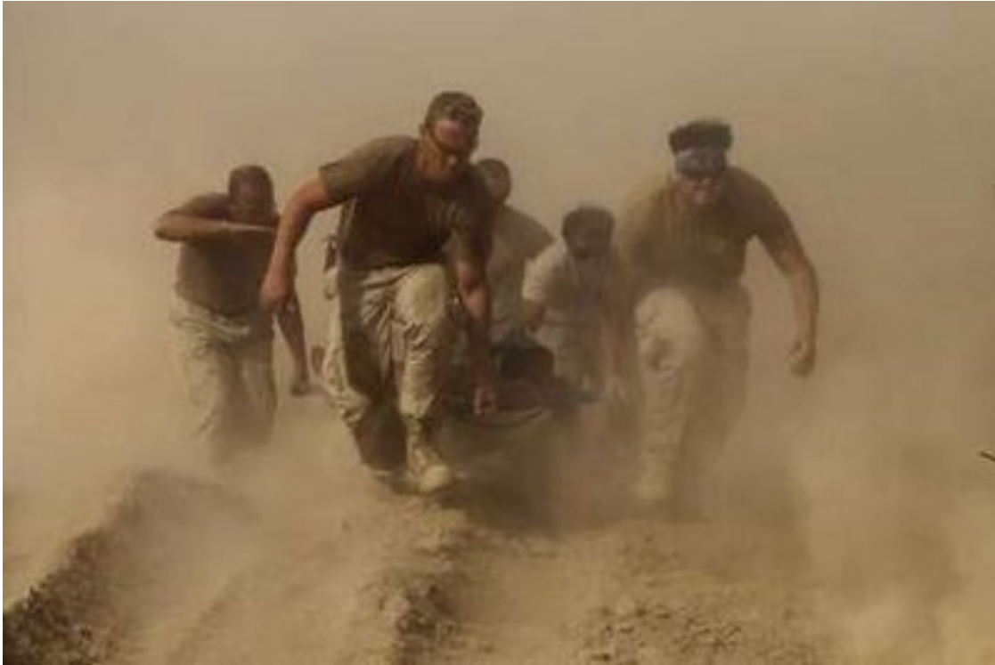
Members of the U.S. Navy carry a comrade wounded by an explosion to a medevac helicopter in Kandahar province in southern Afghanistan October 2, 2010.