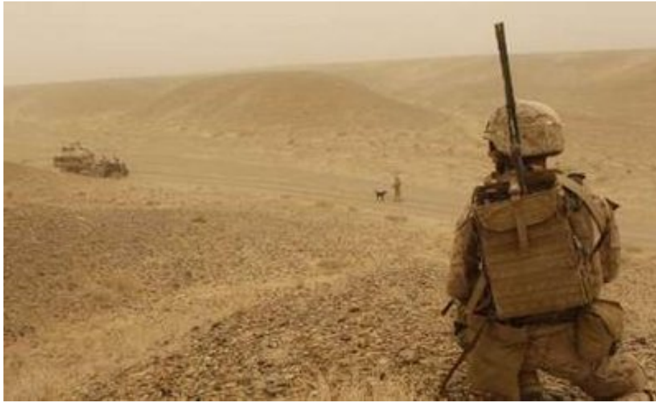
A U.S. marine from the 1st Light Armoured Reconnaissance Battalion patrols near a sandstorm in a desert in Helmand, Afghanistan, September 13, 2010.