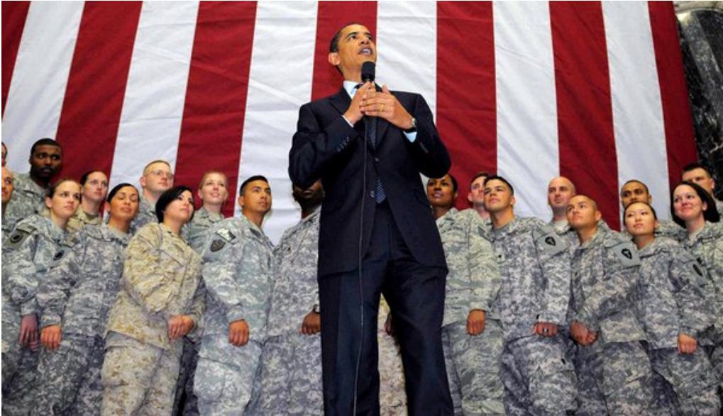
President Obama announces that U.S. forces in Iraq have, for lack of a better word, “won” the war.