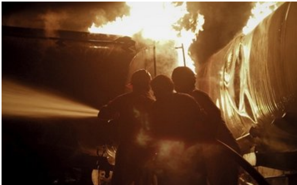
Burning oil tankers after militants attacked a terminal in Rawalpindi, Pakistan, early Monday, Oct. 4, 2010. The attack burned at least 20 oil tankers in Pakistan that were en route to US troops in Afghanistan.