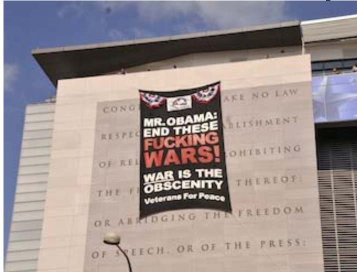
Banner hung by members of Veterans For Peace, Washington DC, 10.2.2010

“Whatever Average People Have Won Has Involved Much More Than The Use Of The Tactic Of Civility”