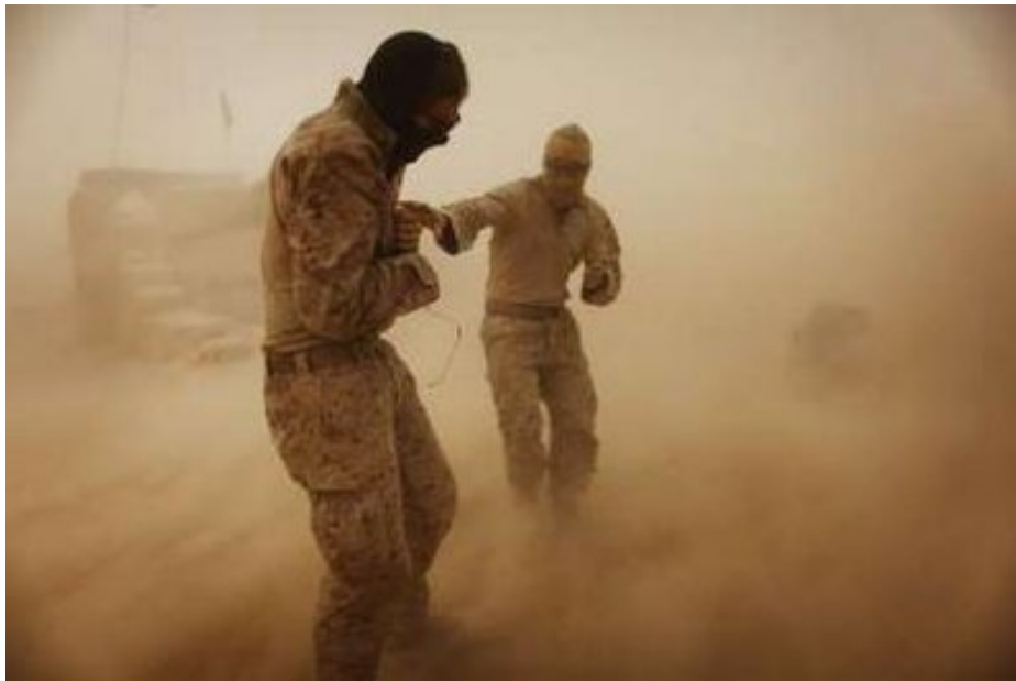
A U.S. Marine reaches out to his comrade as they struggle through heavy winds during a sandstorm at their remote outpost near Kunjak in southern Afghanistan's Helmand province, October 28, 2010.