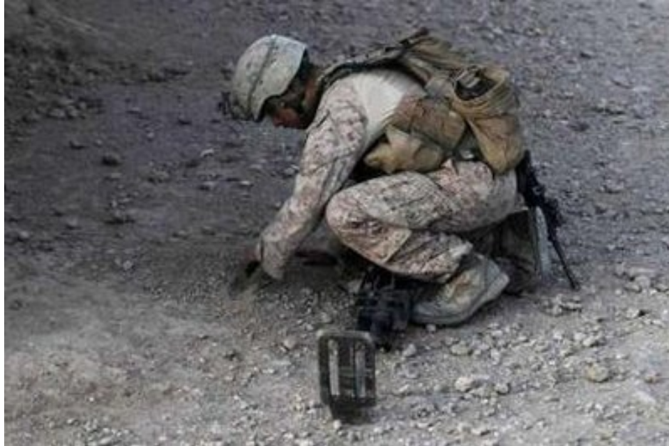
A U.S. Marine Mine sweeper from Eighth Marines uncovers an improvised explosive device during patrol in the town of Nabuk in southern Afghanistan's Helmand province, October 31, 2010.