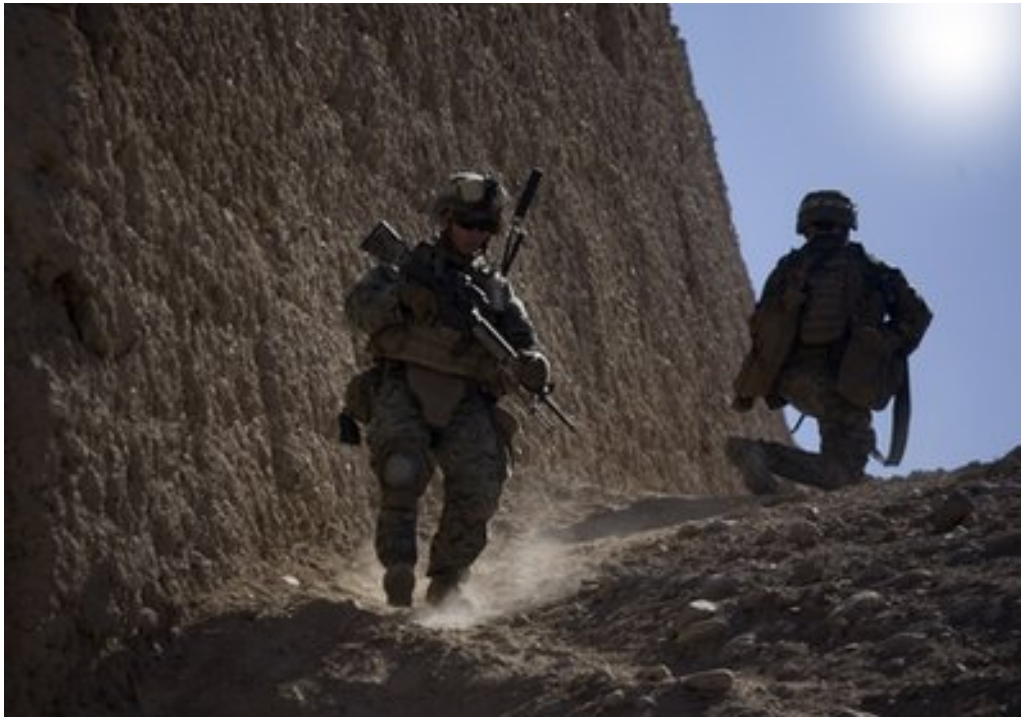
U.S. Marines from First Marine Division move on rough terrain, Nov. 7, 2010 in Sangin, Afghanistan.