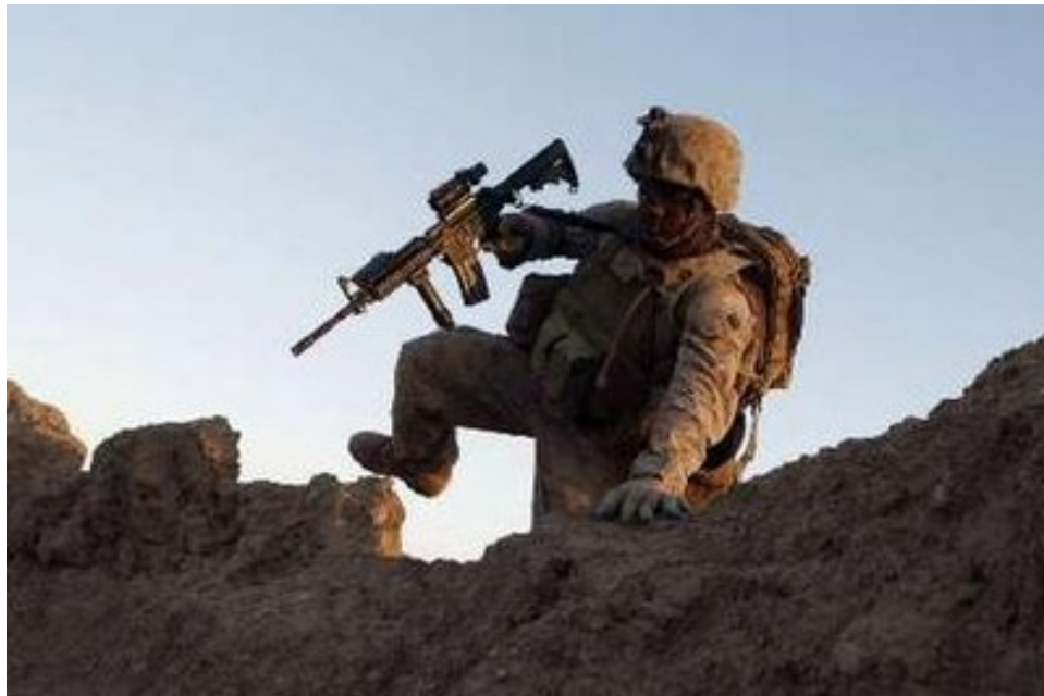
A U.S. Marine from the Eighth Marines Alpha Company on patrol in the town of Nabuk in southern Afghanistan's Helmand province, October 31, 2010.