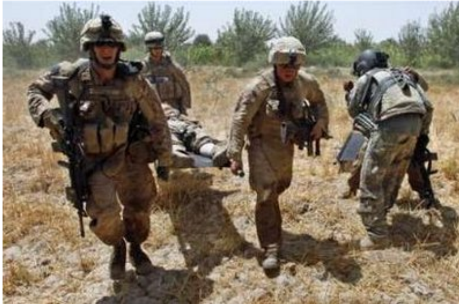
U.S. Marines carry a wounded comrade to a waiting medevac helicopter near the town of Marjah in Helmand Province, August 17, 2010.

THIS IS HOW OBAMA BRINGS THE TROOPS HOME: BRING THEM ALL HOME NOW, ALIVE