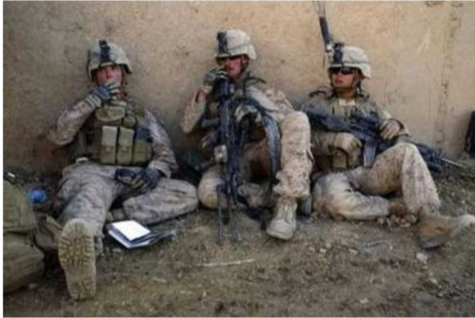
Concussed U.S. Marines rest in a compound offering cover after rocket propelled grenades exploded near their positions during a battle against Taliban insurgents in the town of Nabuk in southern Afghanistan's Helmand province, November 1, 2010.