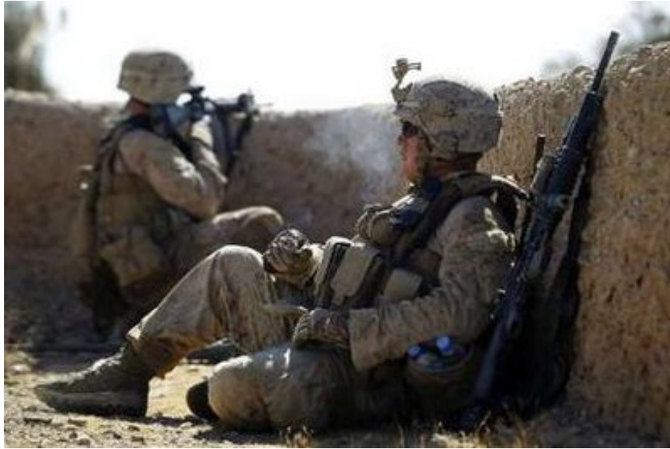
U.S. Marines from Eighth Marines during a break in fighting with Taliban insurgents in Musa Qala district, southern Afghanistan's Helmand province November 7, 2010.