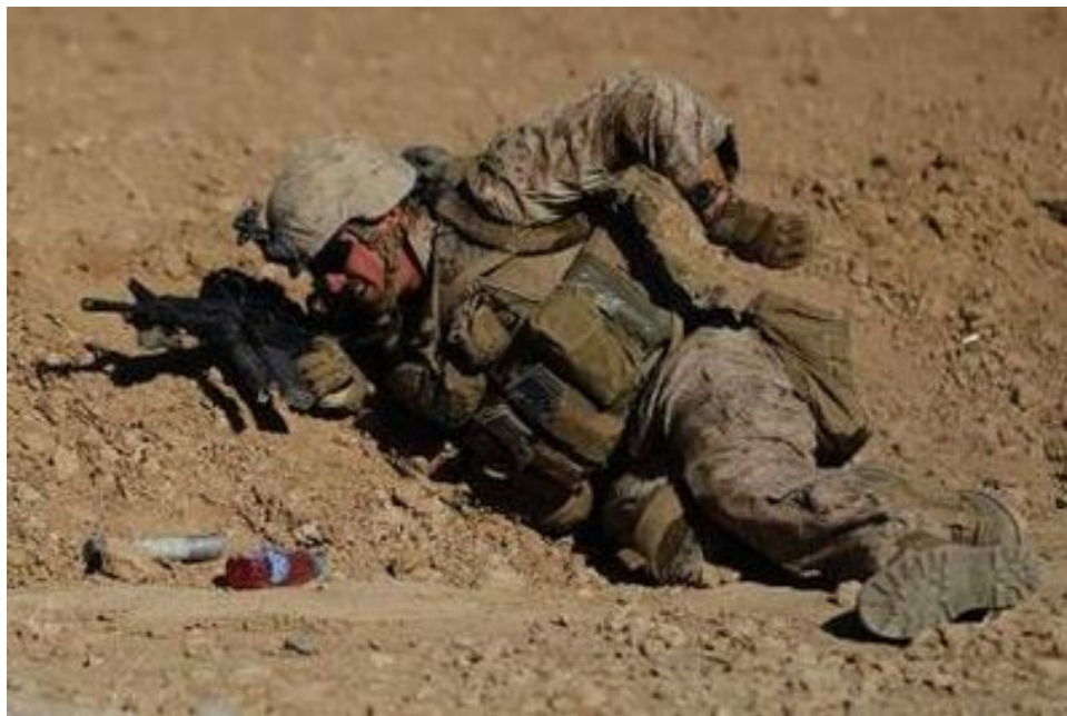
A U.S. Marine from 8th Marines Alpha Company takes cover from incoming fire from Taliban insurgents while reaching for more ammunition during battle in the town of Nabuk in southern Afghanistan's Helmand province, November 1, 2010.