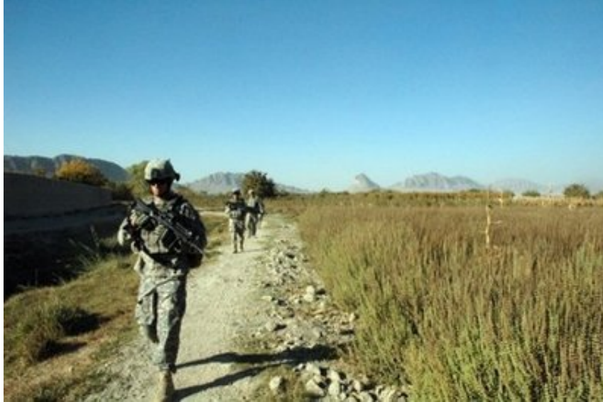
US soldiers patrol in the Mahalajat area on the edge of Kandahar city on November 6, 2010.