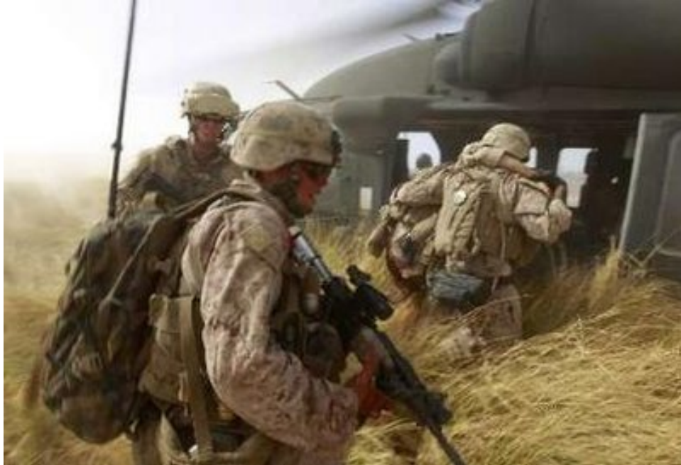
U.S. Marines help their wounded comrade to a helicopter while under fire during a Medevac mission in southern Afghanistan's Helmand Province November 10, 2010.

POLITICIANS CAN'T BE COUNTED ON TO HALT THE BLOODSHED