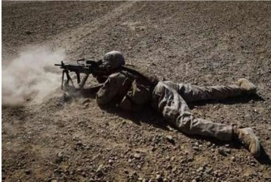
A U.S. Marine from the First Battalion, Eighth Marines during a battle against Taliban insurgents in Musa Qala district in southern Afghanistan's Helmand province November 7, 2010.