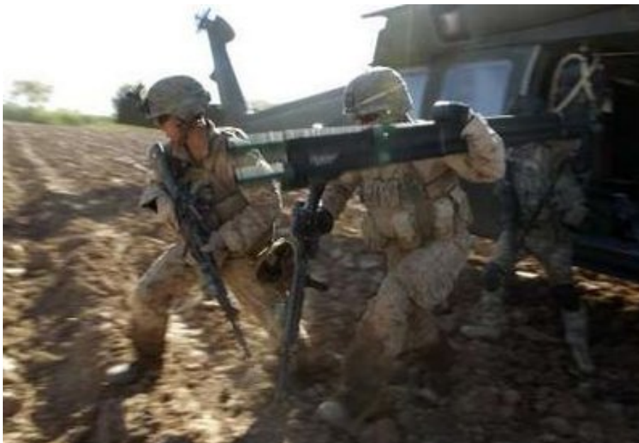
U.S. Marines carry stretchers as they run to pick up their wounded comrade during a Medevac mission in southern Afghanistan's Helmand Province November 8, 2010.