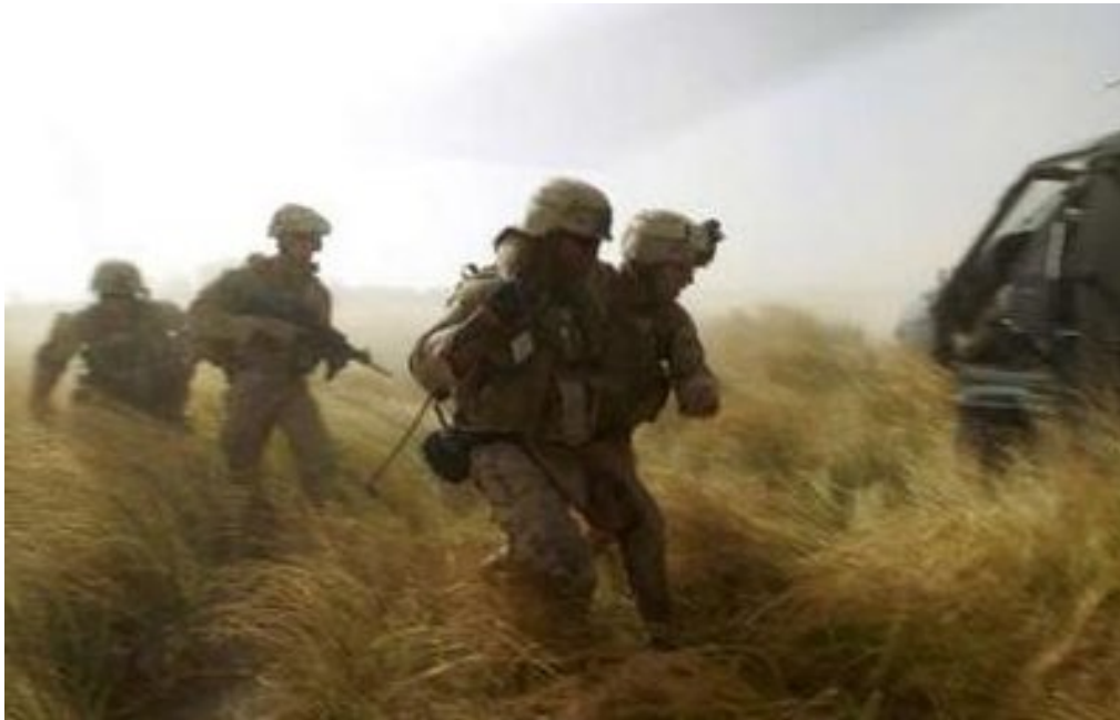
U.S. Marines help their wounded comrade to a helicopter while under fire during a Medevac mission in southern Afghanistan's Helmand Province November 10, 2010.