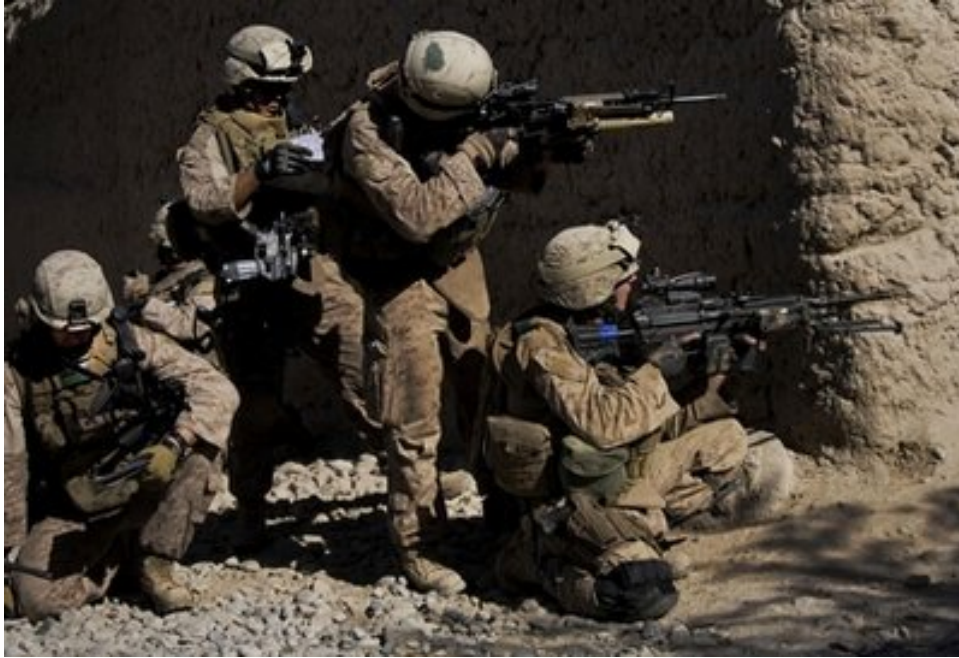
Marines of 3rd Battalion 5th Marines, First Marine Division, take cover under fire Nov. 10, 2010 in Sangin, Afghanistan