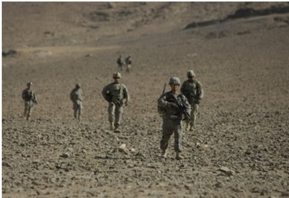
U.S. soldiers from First Battalion, 502nd Infantry Regiment, 101st Airborne Division patrol in West Now Ruzi village, district Panjwai, Afghanistan's Kandahar province, Nov. 24, 2010.