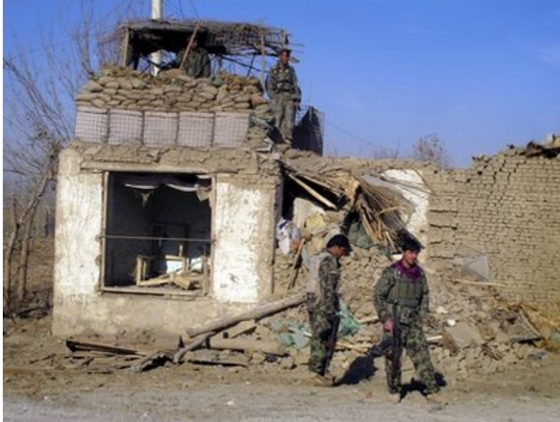
Damaged military check post after an insurgent attack in Kunduz, north of Kabul, Afghanistan, Dec. 11, 2010. A bomber blew up a stolen police car that had been packed with explosives, injuring five Afghan soldiers.