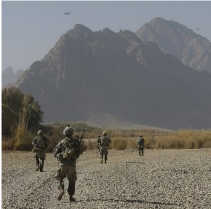
U.S. soldiers from 502nd Infantry Regiment, 101st Airborne Division patrol in Panjwai district, in Afghanistan's Kandahar province, Nov. 23, 2010.

THE UNDOUBTED SUCCESS OF THE U.S. MILITARY EFFORT MAY BE SEEN HERE, SHOWING THE VAST QUANTITIES OF AFGHANISTAN THAT HAVE BEEN LIBERATED, AND WILL FORM THE BASIS FOR A NEW, FREE, DEMOCRATIC AFGHAN SOCIETY