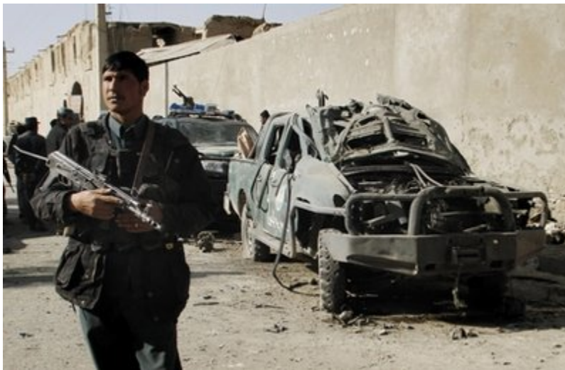
Damaged police vehicles after an insurgent attack in Kandahar, Afghanistan Dec. 11, 2010. A car bomb exploded outside a police headquarters in Kandahar, wounding at least four police and blowing out the windows of buildings up to a mile away.

12.10.10 ANP/AFP & December 11, 2010 By Borzou Daragahi, Los Angeles Times Staff Writer