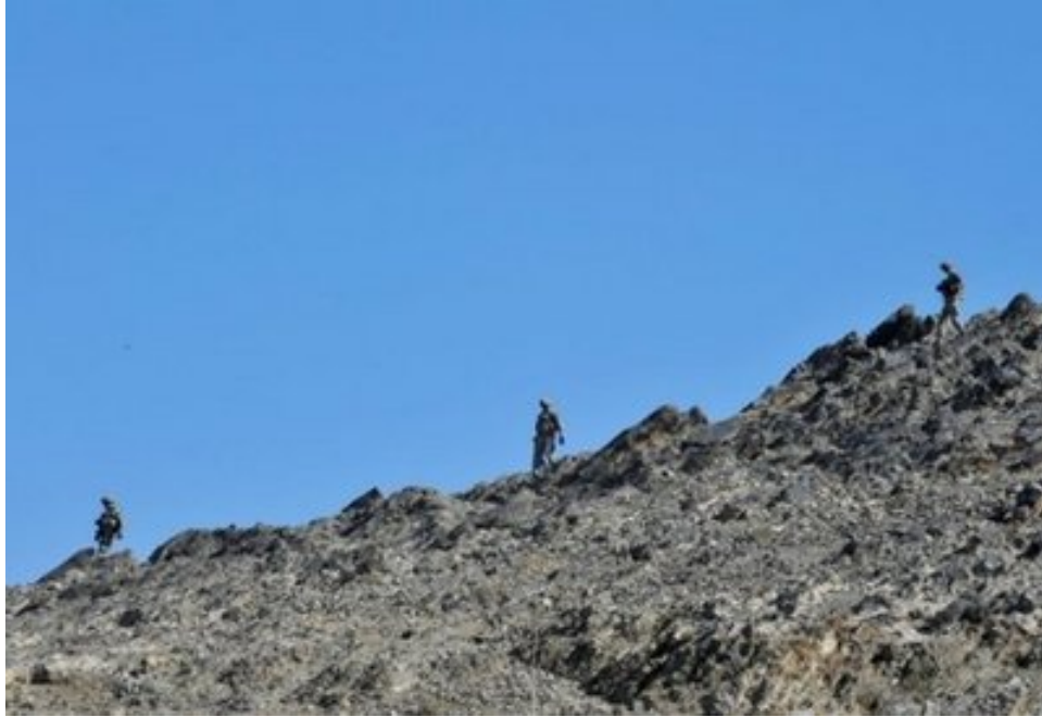
11.24.10: U.S. soldiers patrol in Laghman province.