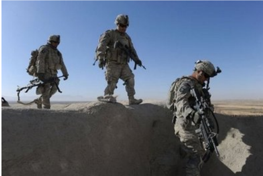
US soldiers patrol in Bangi village, Andar district in Ghazni province on January 6, 2011.