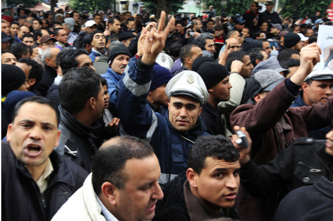
National guard members and firemen join demonstration against the government

Tunisia: National Guard Members Join Demonstration Against The Government: “Please Don’t Storm The Office Of The Prime Minister” Cops Plead: “But Protesters Were Already Starting To Break The Barricades By Late Afternoon”