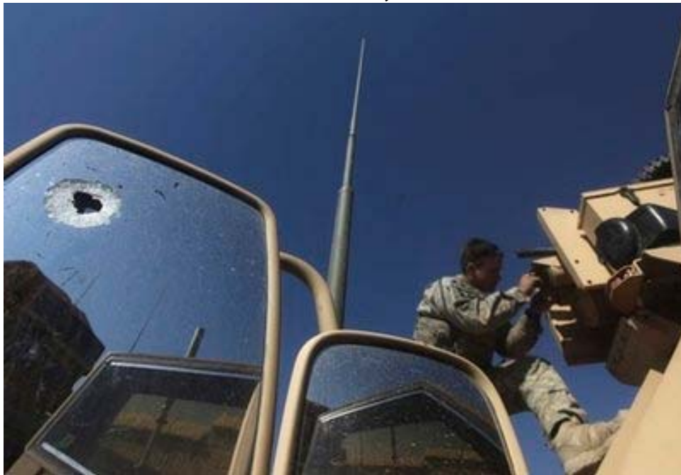
A bullet hole in a mirror of U.S. armored vehicle at Fortress Combat Out Post in Kunar province in eastern Afghanistan near Pakistan border Jan 3, 2011.