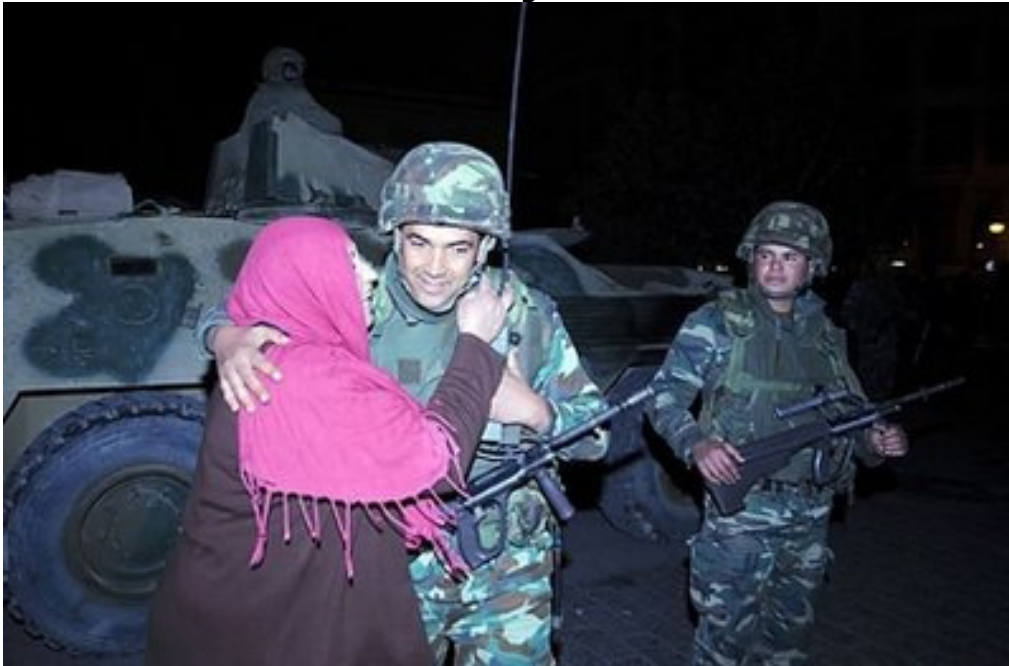
January 12, 2010: A woman kisses a Tunisian soldier as they celebrate the growing power of the revolutionary movement from below that forced the President-Dictator of Tunisia to run away from the country January 14.

Why Mine Warfare Is Good For Protracted War: “The Insurgents Have Doubled The Total Number Of Casualties Inflicted By Mines In Just The Last Two Years Of The Nine Year War”