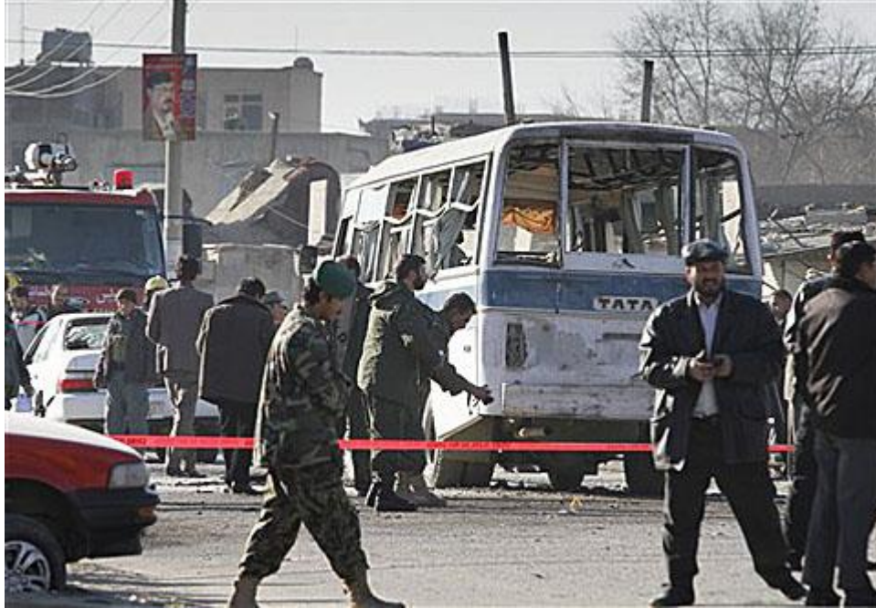
Damaged intelligence agency minibus attacked by a bomber in Kabul, Afghanistan, 12 Jan 2011.