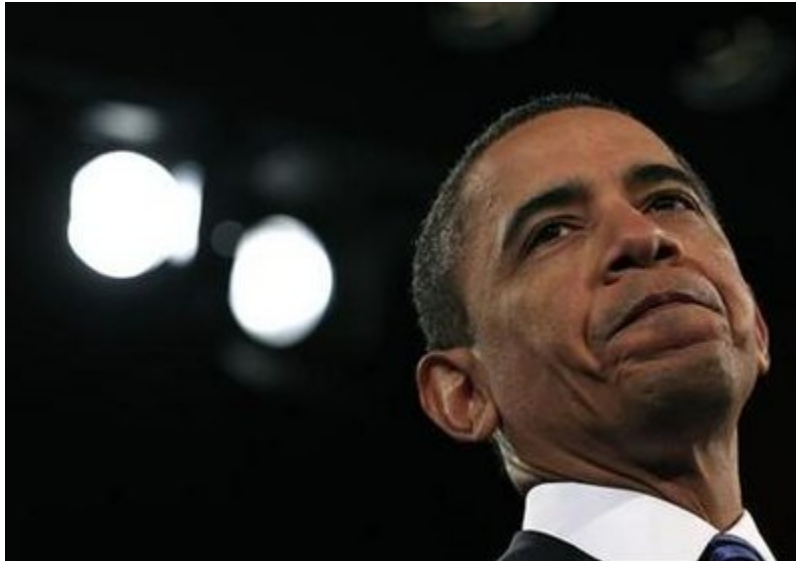
2.7.11: REUTERS/Jim Young