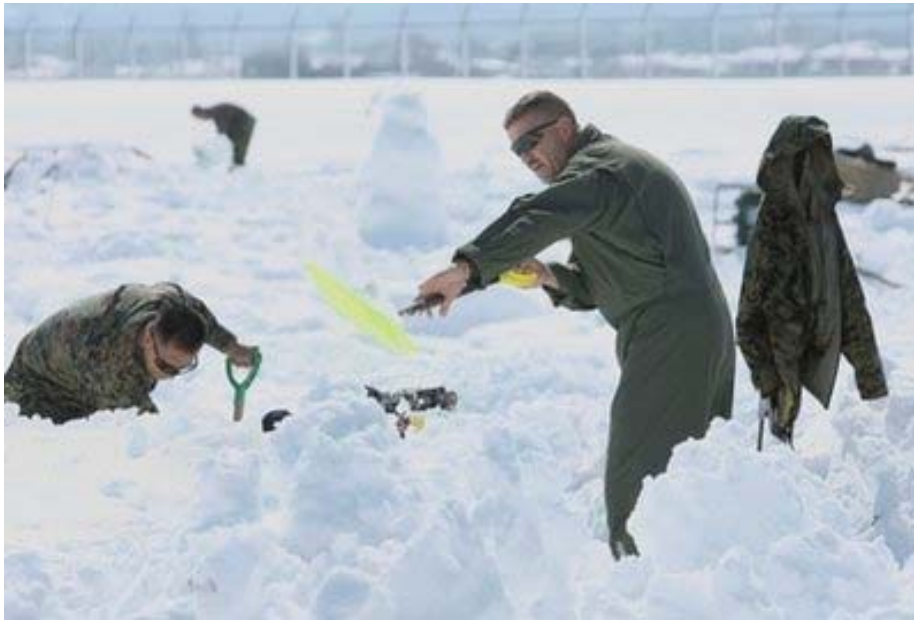
U.S. soldiers clear portions of the runway in assisting relief efforts for quake and tsunami victims, March 18, 2011, at the Jinmachi Air Base in Yamagata, Yamagata Prefecture, Japan.