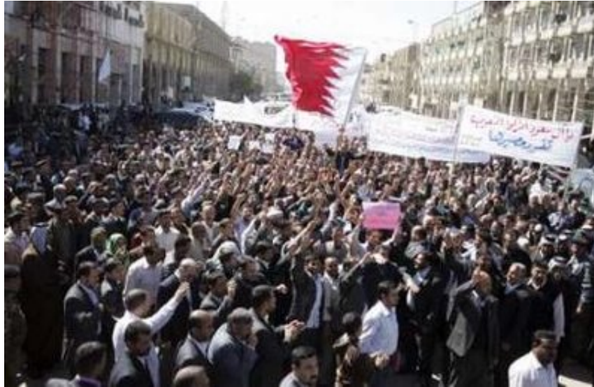
Protesters a Bahraini flag during a demonstration in Kerbala, Iraq, March 17, 2011, in support of demonstrators in Bahrain, denouncing intervention by Saudi troops. The banner on right reads "Saudi ruling family, let the people decide its future".