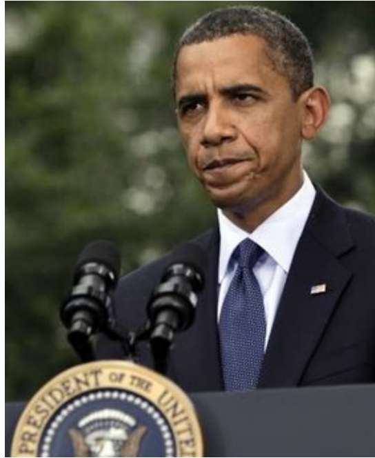
July 15, 2010: REUTERS/Yuri Gripas

Bush Bombed Iraq 19 March 2003, Obama Bombed Libya 19 March 2011: Change We Can Believe In