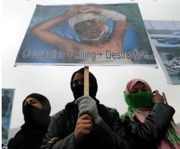
3.6.2011: Hundreds of people, chanting “Death to America!” protested in Kabul on Sunday over a spate of civilian casualties caused by U.S. forces, a sign of the simmering anti-Western emotion among ordinary Afghans.