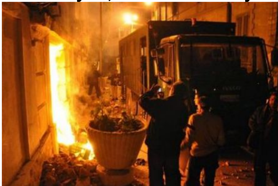
Hundreds of Egyptian protesters set on fire a state security building in Alexandria on March 4, 2011.

“Her Voice Broke And Tears Spilled Onto Her Black Veil. ‘This Place Must Be Destroyed,’ She Said Softly”