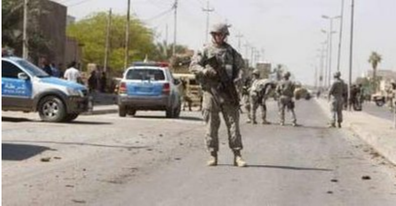
A U.S. soldier stands guard near the site of a bomb attack in Basra, 342 miles south of Baghdad, March 6, 2011.