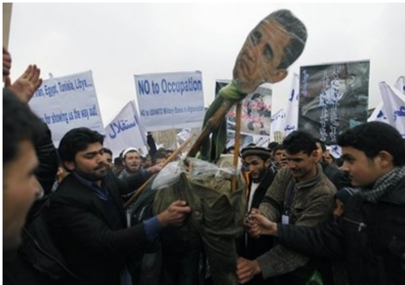
Afghans burn an effigy of U.S. President Barack Obama during a protest in Kabul, Afghanistan, March 6, 2011. Hundreds of people marched through the streets of central Kabul to protest against U.S. military operations and demanded the withdrawal of foreign troops.