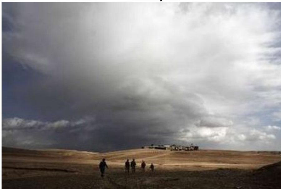
U.S. Marines from the First Battalion Eighth Marines return to their base at the end of a patrol near the town of Kunjak in southern Afghanistan’s Helmand province February 23, 2011.