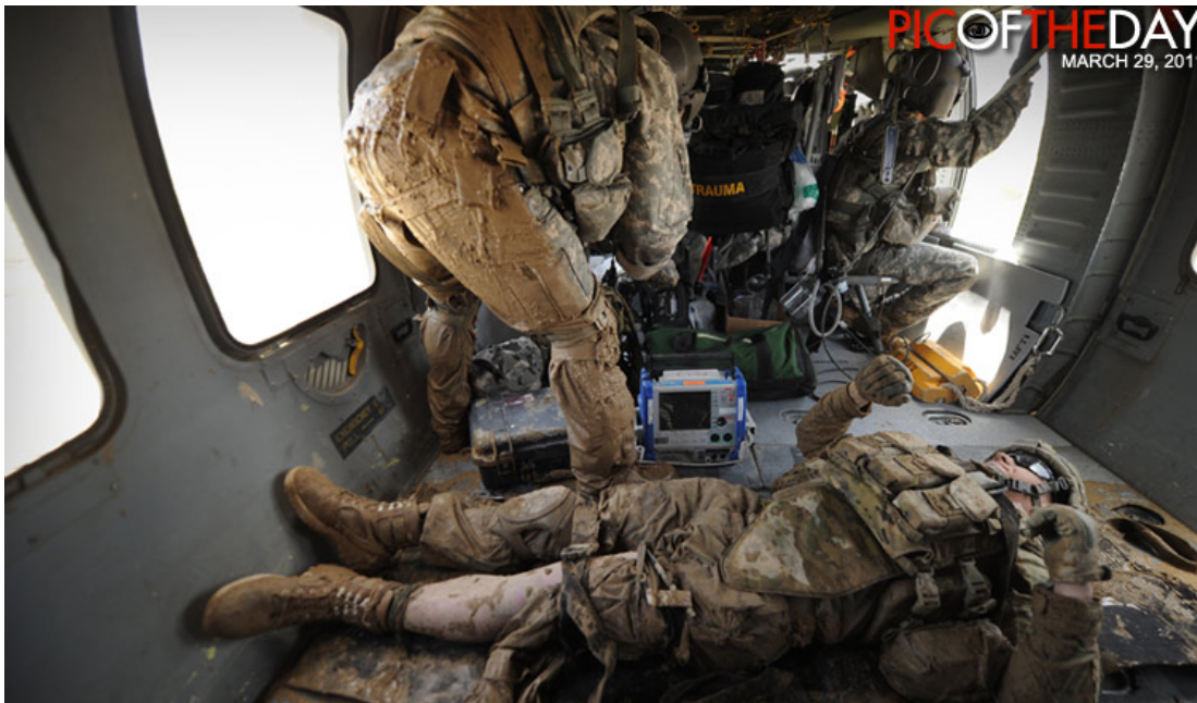
A US soldier is treated on the floor of a Blackhawk helicopter after being wounded during a mission in Kandahar province of southern Afghanistan.