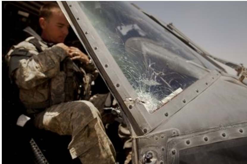
Sangin, Helmand Province, Afghanistan, June 3, 2011. During a rescue mission, a U.S. army medevac helicopter came under fire and took bullets into the pilot window and the helicopters blades.