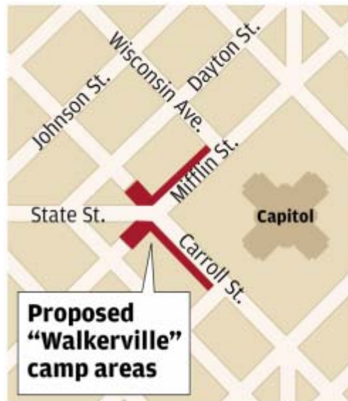
Map of Walkerville.