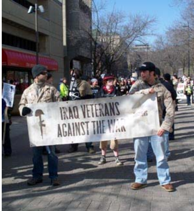
IVAW at Wisconsin State Capitol, March 19, 2011.

Spring 2011 The Veteran , Volume 41, Number 1; Vietnam Veterans Against The War: By Di Wood