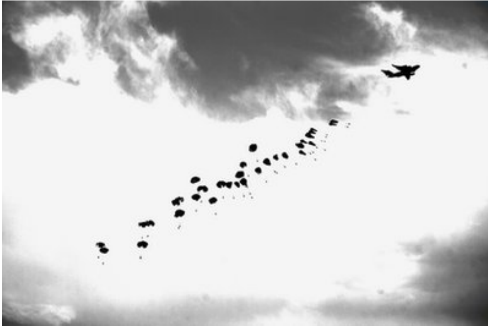
Food supplies for US Marines hanging off small parachutes are dropped from a plane outside Forward Operating Base Edi, Helmand Province, Afghanistan; June 4, 2011.