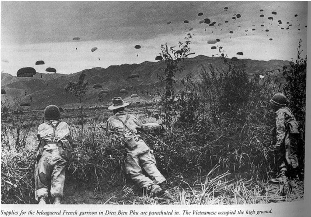
Supplies for the beleaguered French garrison in Dien Bien Phu are parachuted in. The Vietnamese occupied the high ground.

Food supplies for French soldiers hanging off small parachutes are dropped from a plane outside Dien Bien Phu, Dien Bien Province, Vietnam, 1954