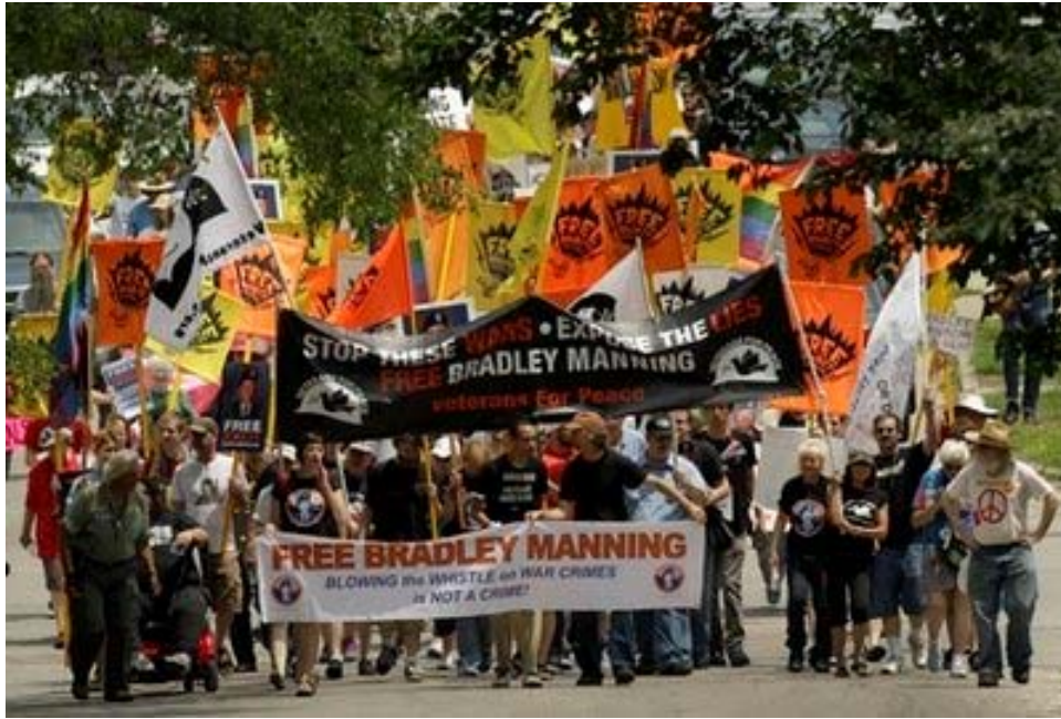
June, 4, 2011: About 250 supporters of U.S. Army Pfc. Bradley Manning march through Leavenworth, Kan. to the gates of Fort Leavenworth where Manning is being held on suspicion of illegally passing government secrets to the WikiLeaks website.