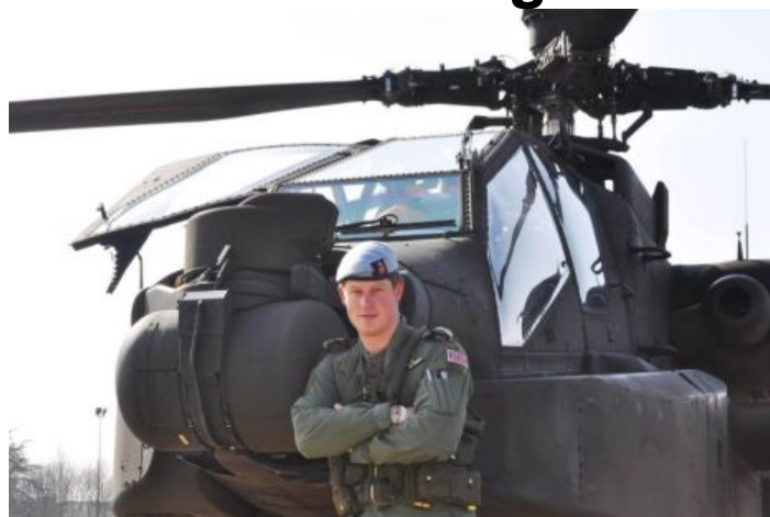
“Learning How To Pee In A Bottle”