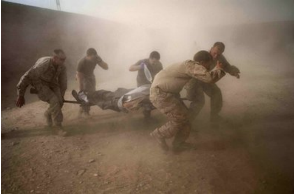
U.S. Marines run through dust kicked up by a Black Hawk helicopter from Task Force Lift 'Dust Off', Charlie Company 1-214 Aviation Regiment as they rush a colleague wounded in an IED strike for evacuation near Sangin, Helmand Province, Afghanistan May 10, 2011.