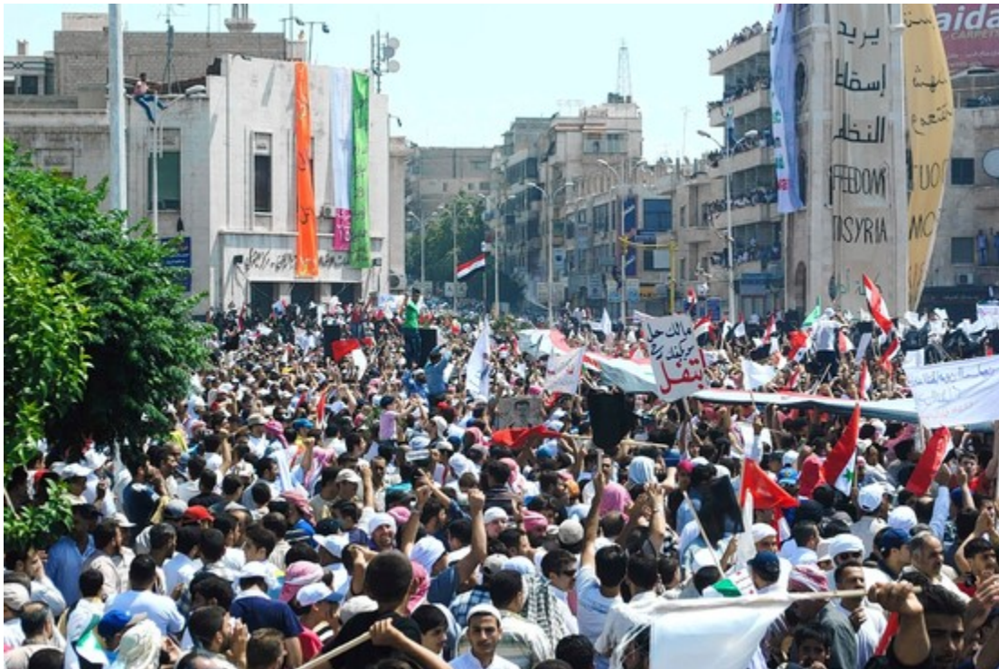
Thousands in Hama demonstrated Friday against President Assad's regime.

“A Group Of 14 Defectors Fought The Army And Security Forces In The Bab Siba’a Neighborhood Of Homs, Killing 20 Of Them And Destroying Four Of Their Tanks And Seven Armored Personnel Carriers”