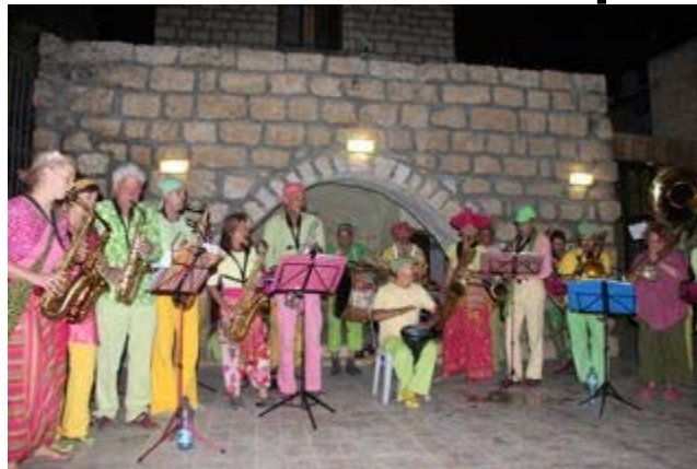
De Fanfare van de Eerste Lief des Nacht - PNN Photos

“They Then Found Themselves Surrounded With Snipers”