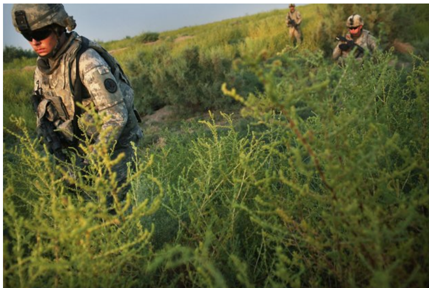
ISKANDARIYA, IRAQ - JULY 15: U.S. soldiers with the 3rd Armored Cavalry Regiment patrol in Iskandariya, Babil Province, Iraq. less