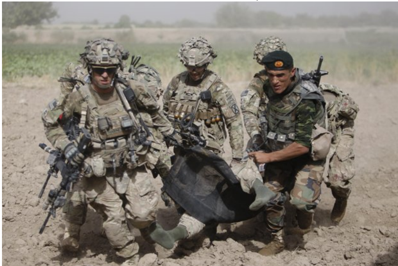
A wounded U.S. soldier following an attack near Kandahar, Afghanistan, July 30, 2011.

THIS IS HOW OBAMA BRINGS THEM HOME: ALL HOME NOW, ALIVE