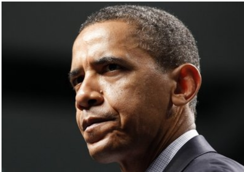
June 15, 2011

Military Resistance Available In PDF Format If you prefer PDF to Word format, email contact@militaryproject.org