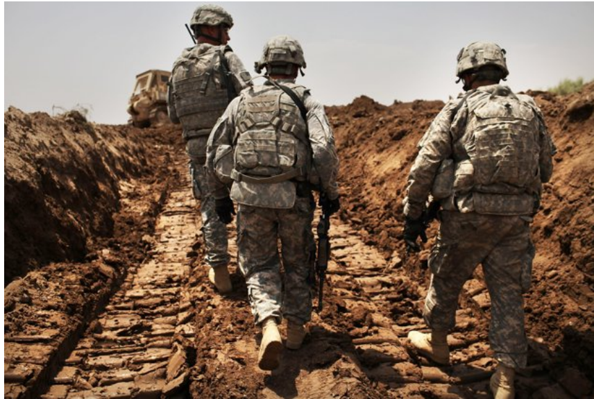
ISKANDARIYA, IRAQ - JULY 19: U.S. soldiers with the 3rd Armored Cavalry Regiment patrol a new ditch they have dug to protect the base from attack on July 19, 2011 in Iskandariya, Babil Province Iraq.