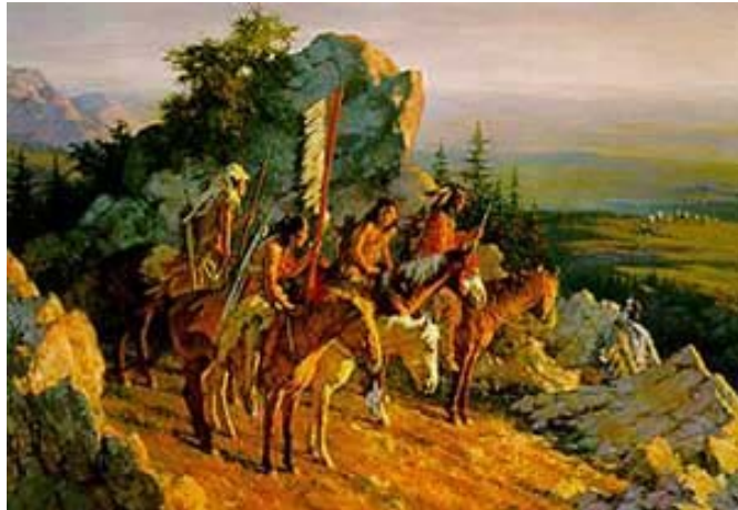
Lakota Sioux watch as their Black Hills are invaded. Painting by Howard Terpning