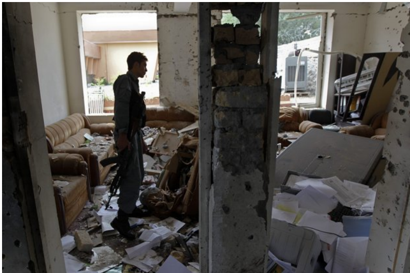
Destruction caused at the compound of the governor of Parwan province in Charikar, August 14, 2011.