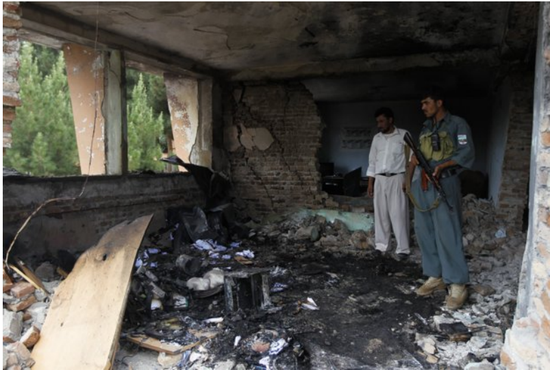
Destruction caused at the compound of the governor of Parwan province in Charikar, August 14, 2011.