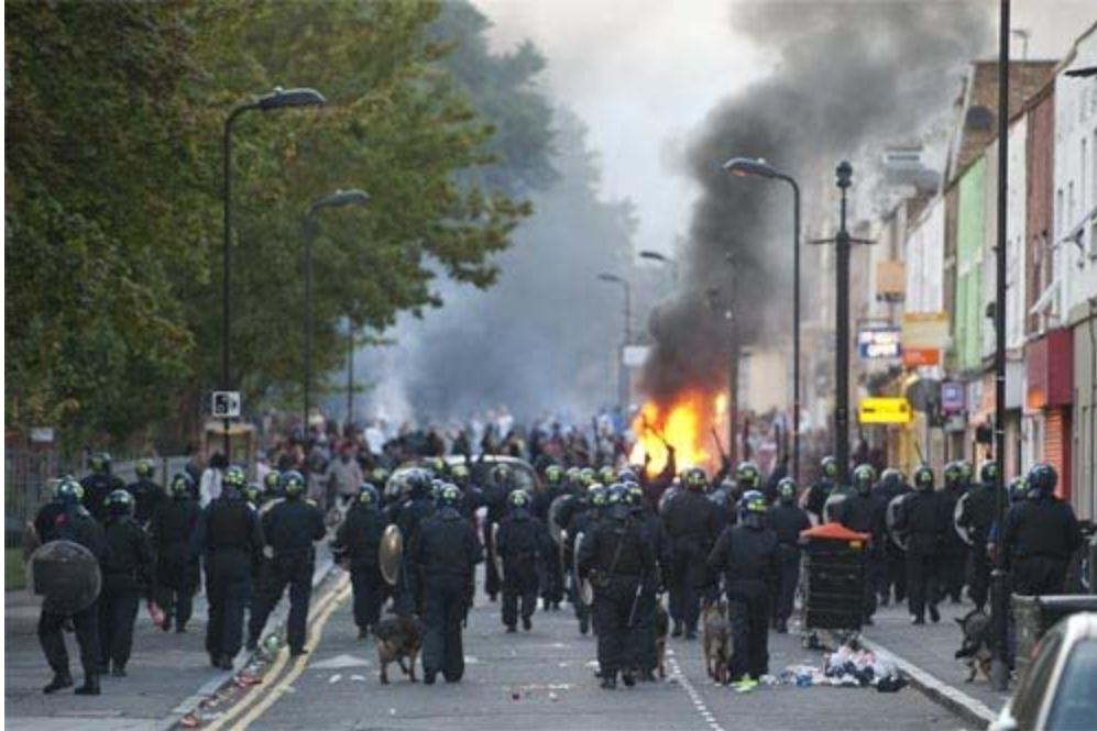
Riot police with batons drawn on the streets of Hackney on Monday

Just Cause For Rebellion: “High Youth Unemployment And Recent Government Budget Cuts Have Made Young People Feel They ‘Don’t Have A Future’”