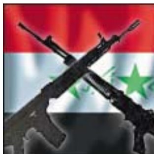
(Graphic: London Financial Times)

Reuters 10 Aug 2011 & Reuters 11 Aug 2011